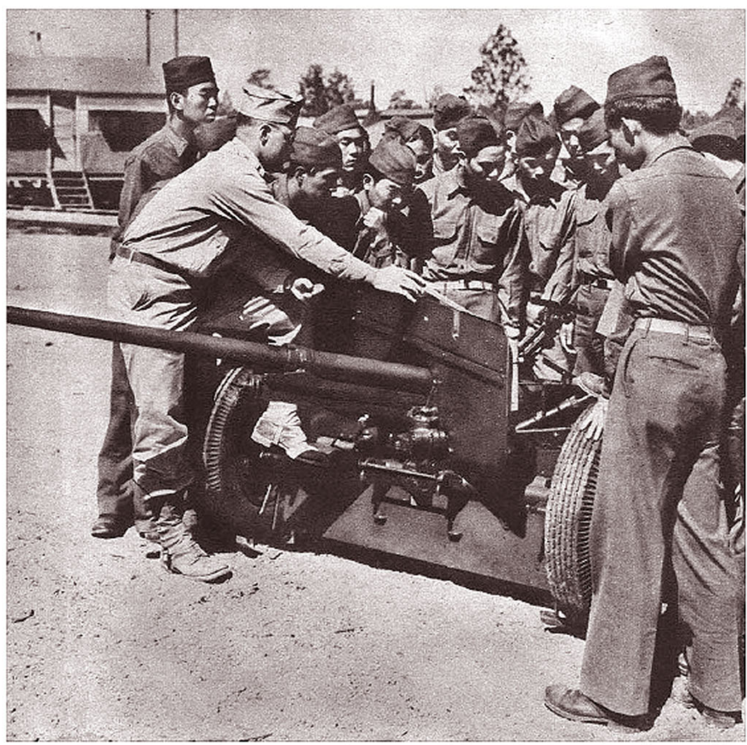
GUNNERY INSTRUCTION is duck-soup for many of these Japanese-American soldiers. Officers assigned to instruct them say they are quick to learn and devote much of their free time to studying military tactics. Few fail to make the training grade.