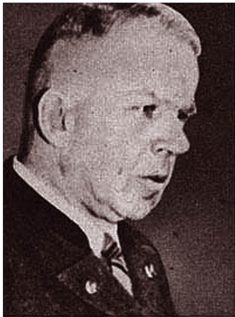
MAX AMANN , publisher of Mein Kampf , Hitler's blueprint for world conquest, was jailed by denazification court but, like other Nazi press lords, plan return to trade.