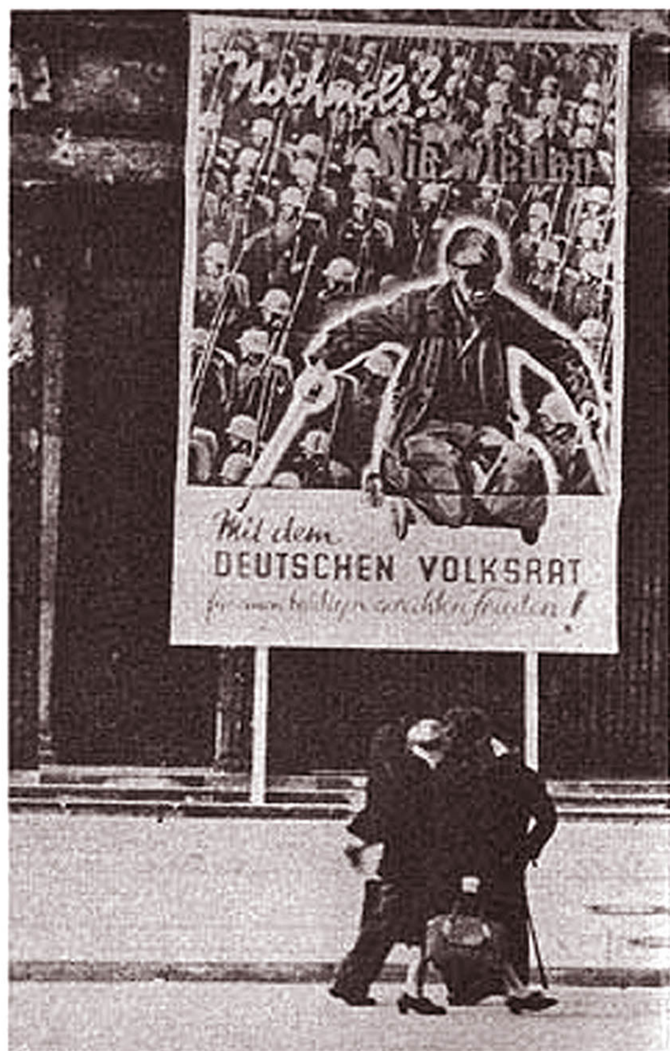
Red poster on Germany's Tomb of Unknown Soldier shows amputee, troops. "Again?" It asks, innocently.