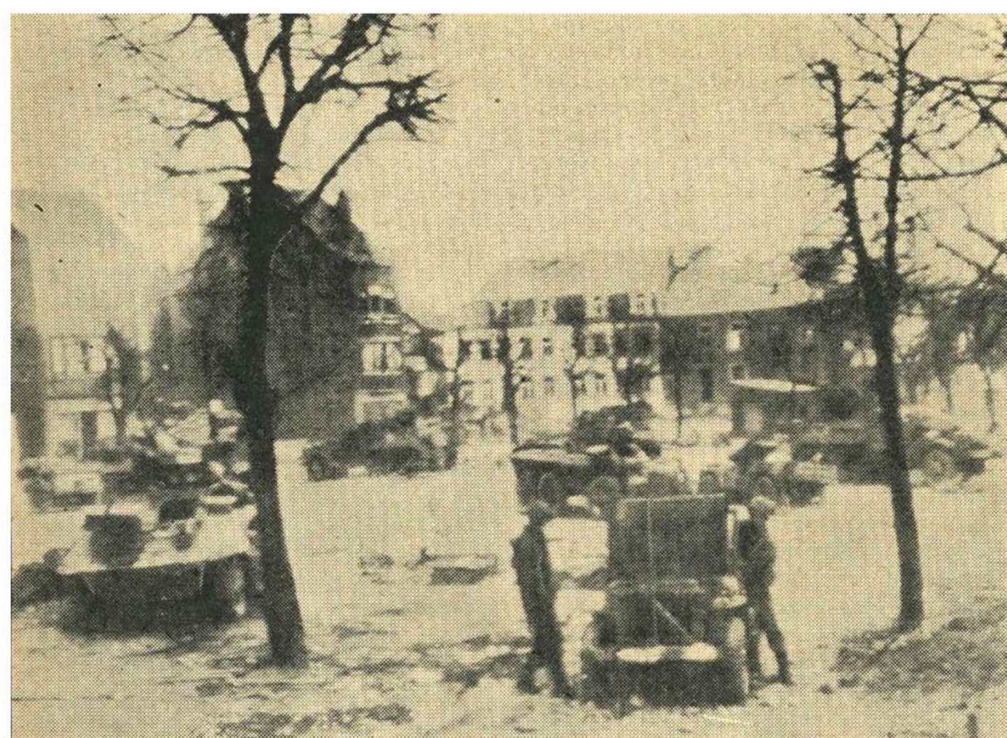
Reunion in Bastogne: Vehicles of the rescuing American Fourth Armored Division mingle with those of the Tenth after the Nazi siege is lifted