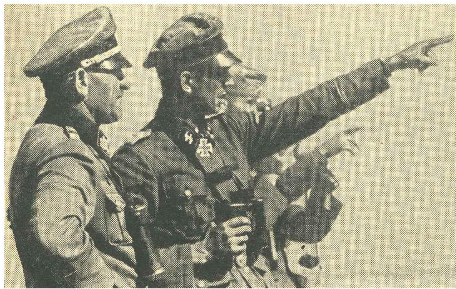
The panzers of General Dietrich (far left)

But the Americans paid heavily for their victory. The casualties ran to nearly 10 per cent, and they lost much equipment. Nevertheless, the Screaming Eagle Division was all for pursuing the Germans. Justly proud of the magnificent showing of his soldiers, a colonel said: “These men of ours sure are going to be insufferable from now on!”