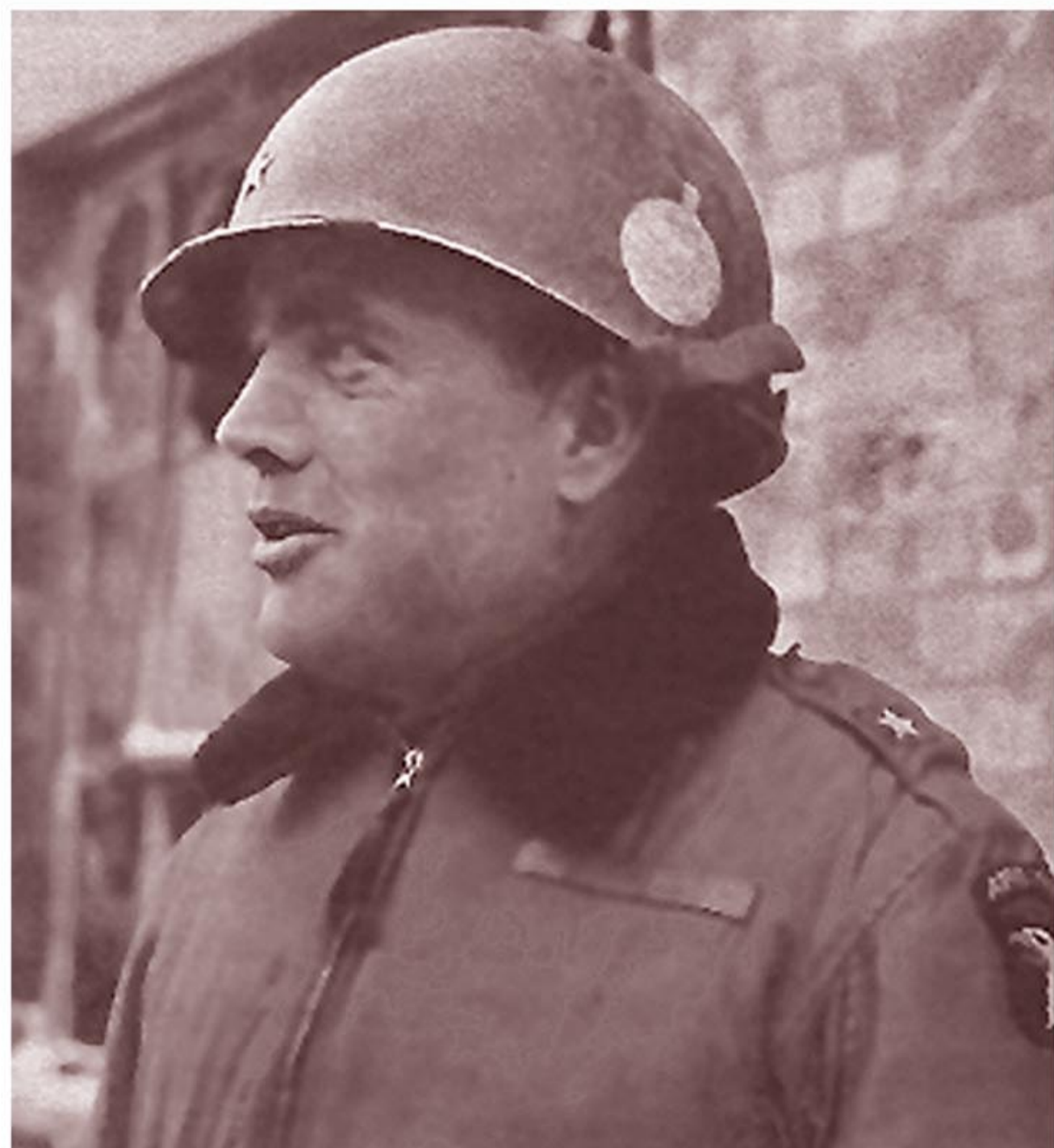
General McAuliffe: Nuts from the U.S.A.

Three days before Christmas, on the third morning of the siege, the shelling stopped; an unnatural silence fell on battered, surrounded Bastogne in Eastern Belgium. Up the road from the south, bearing a white sheet as a token of truce, came a Nazi major and a captain. They carried an ultimatum from the German commander to the Americans in the town. By sticking to their guns in the face of tremendous odds, the Yanks were holding up the development of the southern part of Marshal Karl von Rundstedt's great break-through offensive.