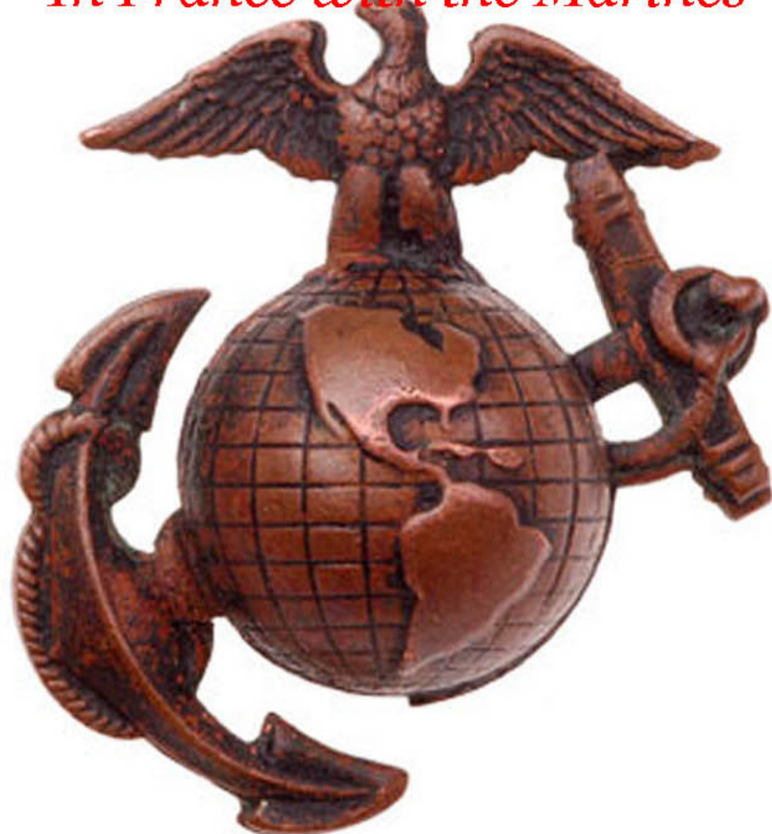
- the 1905 Eagle, Globe and Anchor cap device worn on their helmets