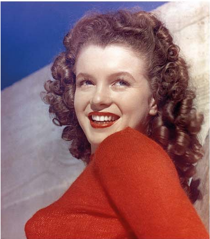
MARILYN'S FIRST PHOTO