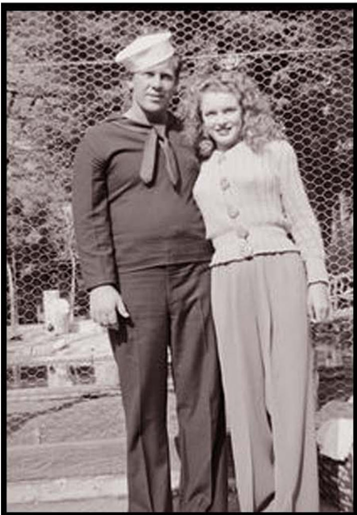
The Future "Marilyn" as Mrs. Joe Dougherty