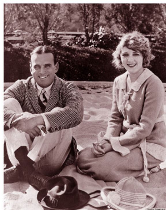
Douglas Fairbanks and Mary Pickford

this confession, it was obvious that their two years of married life have not spoiled their romance. If Mary Pickford is not head over heels in love with Douglas Fairbanks, then she is a far greater actress off the screen than she is on it. I have observed many young married couples, but I have never seen such unmistakable devotion as this famous married pair lavish on each other. They literally hang on each other's words—even the most trivial matters are referred to each other's opinions. In fact, they still act as tho they were on their honeymoon.