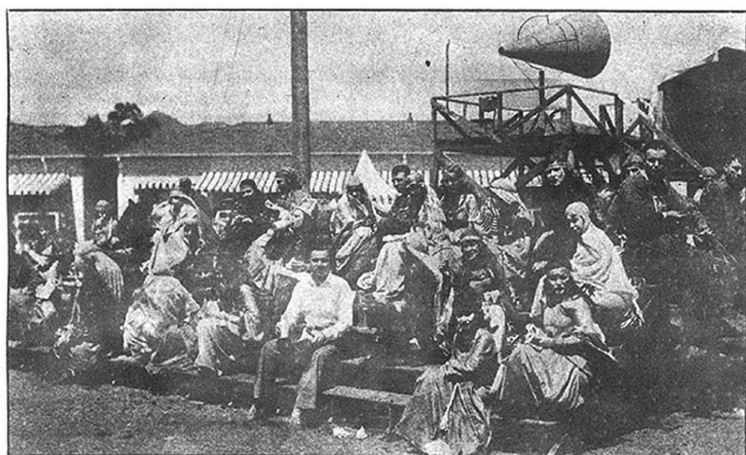
TYPICAL HOLLYWOOD INHABITANTS "ON THE JOB."

The chief excitement they may find in the famous celluloid city, says a careful investigator, is getting calluses on their waists by carrying trays in the local cafeterias. The "Horrors of Hollywood," in his candid opinion, are those of any "forlorn suburb" where there is "never anything doing."