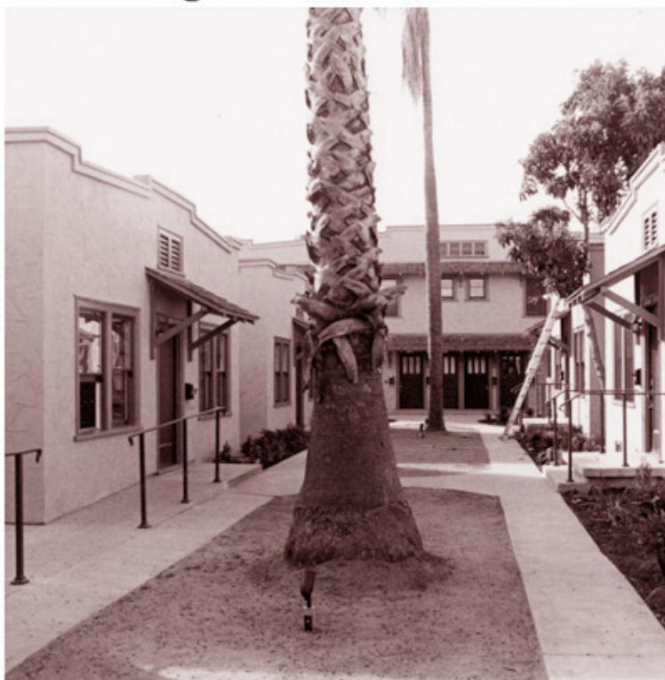
One of the many Spanish-Colonial style courtyard apartments being built in Los Angeles at the time.

"I'm going back on the stage next season. They wanted to cut my salary $500 a week and I wouldn't stand for it."