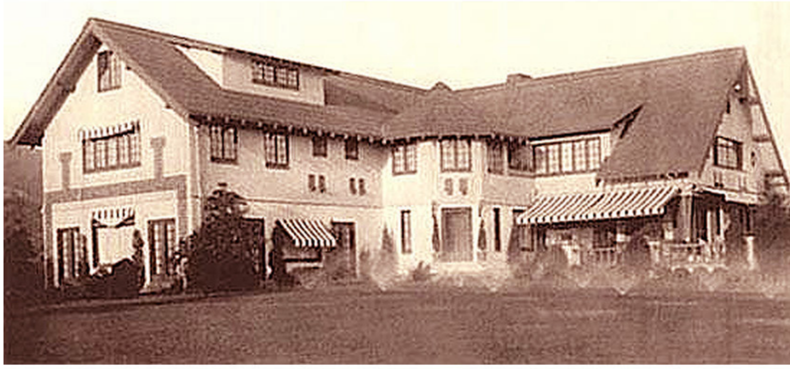
WHERE "DOUG" AND "MARY" LEAD THEIR PLACID LIVES.

So the shutdown has been a good thing for the industry despite the hardship it has worked on many untalented stars