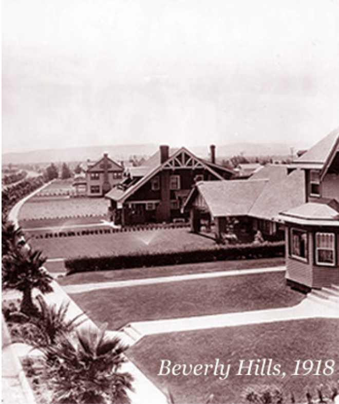
Beverly Hills, 1918

From the admiring glance she gave her actor-husband as she made