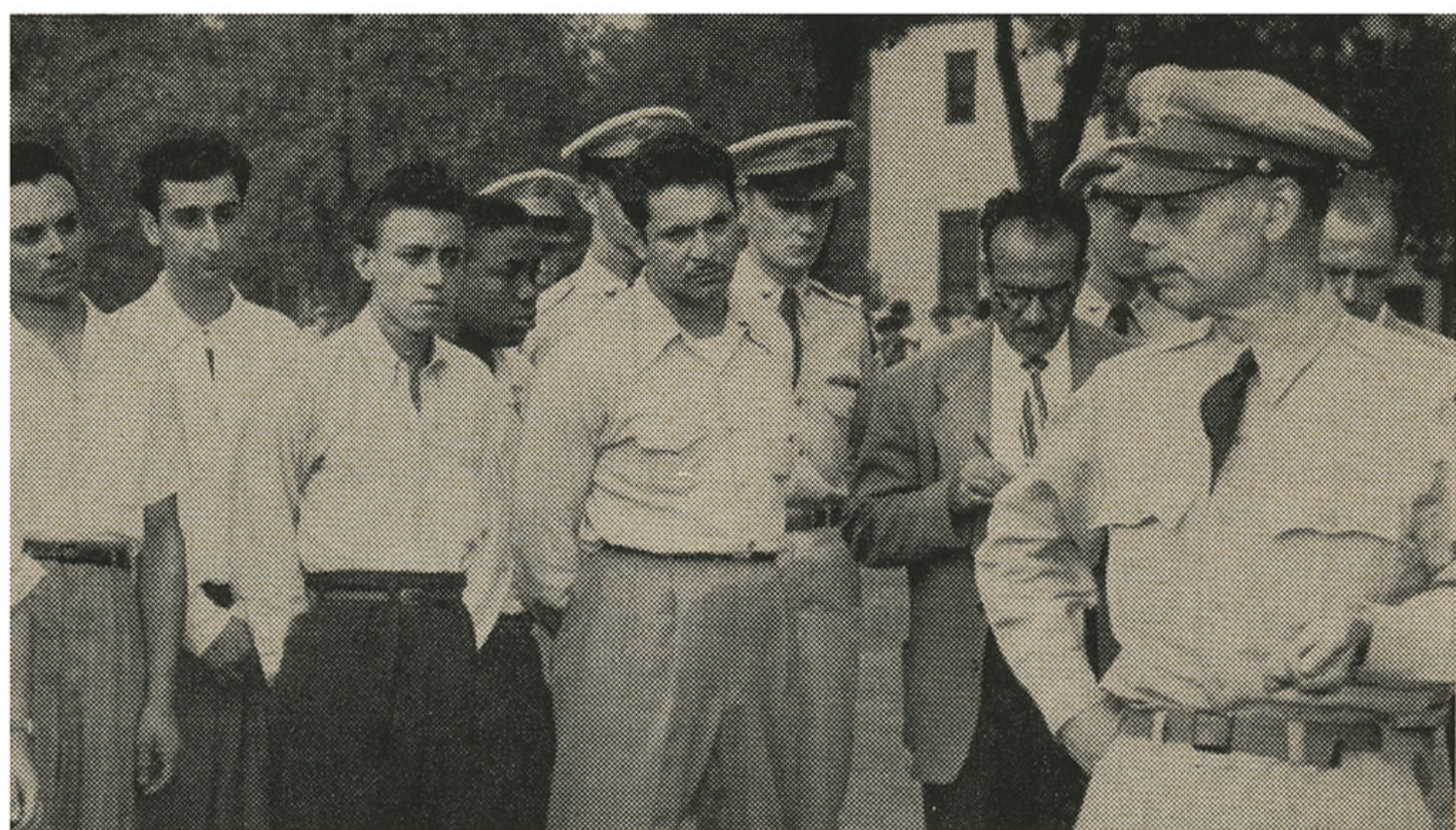
INDUCTEES ARE REVIEWED BY GEN. WALTER BEDELL SMITH

inch over the maximum admissible figure. It was a blow to Schayes; like most young Americans he was prepared to answer his country's call.