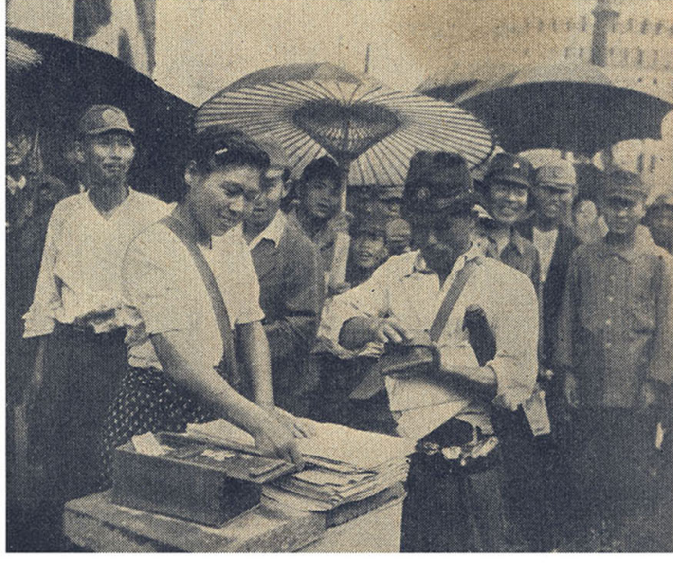
FREEDOM FROM FEAR, FREEDOM OF THE PRESS

.. will democracy "take" in the absence of a long-range occupation policy?