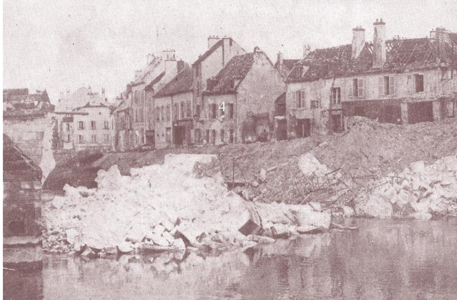
The ruins of the bridge across the Marne at Château-Thierry where the Seventh Machine Gun Battalion, Third Division, helped check the German advance

W HEN, in the early summer of 1918, the Second and Third Divisions of the United States Army scrambled across France and jumped breathless into the fighting near Château-Thierry, there sprang into the minds of the folks at home the notion that "with the help of God and a few Marines," the A. E. F. had then and there halted once and for all the German drive on Paris—that just as the forces of the Imperial German Army, at the height of its power, were advancing on the French capital, they were met on the Paris-Metz road by a handful of Thermopylae-minded young Americans who, with devastating effect, proclaimed "They shall not pass" and so barred the road to civilization. Now this was a delusion, one of the most extraordinary and, in its final effect, one of the most helpful delusions in history.