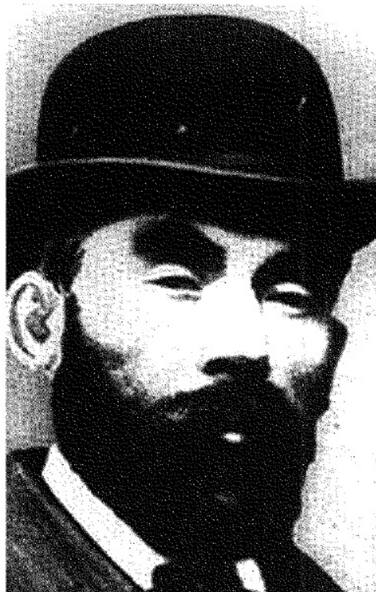
Henri Desire Landru

There were ten women—possibly fourteen—in whom Landru "re-awakened love," lulled suspicion, and robbed of their savings. But did he murder them as palpably as Chaplin's Monsieur Verdoux dispatched his women? An answer of a sort is that Landru lost his head on the guillotine, but hordes of Frenchmen who know the case intimately still discuss it as an