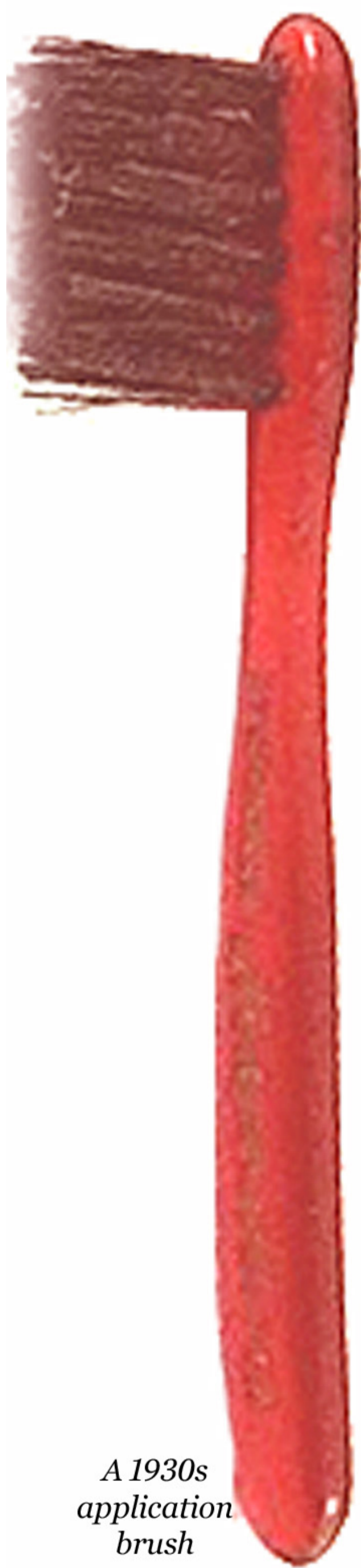
A 1930s application brush