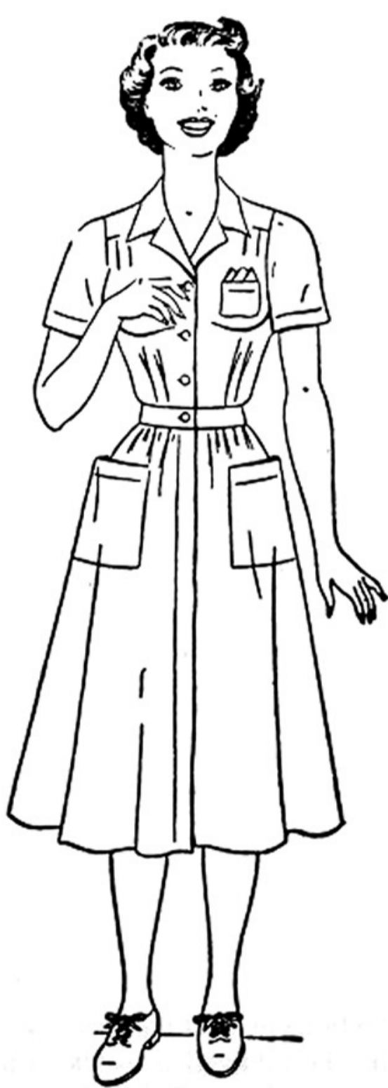
A Well-Groomed Beautician

doubt whether there is any woman in the world who would make the effort necessary for her to look her best, year after year, unless she had an 'audience' of some kind to impress.