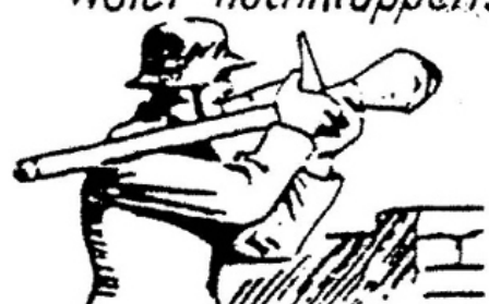
Drückst du jetzt auf die mit Feuer bezeichnete Klinke, geht der Schuss los.

WAR DEPARTMENT TECHNICAL MANUAL TM-E 30-451