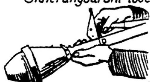
Sicherungsschieber auf „Entsichert“ schieben.