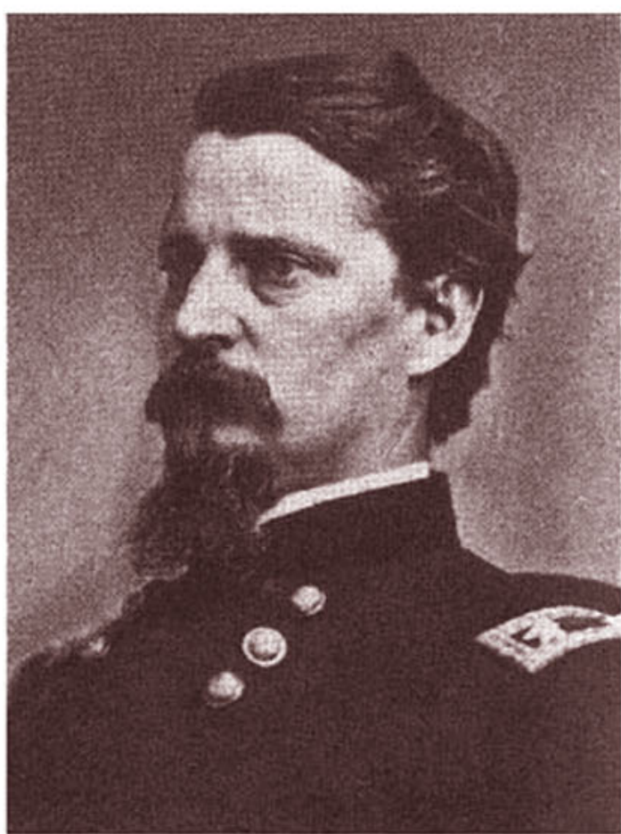
Maj. Gen. Winfield S. Hancock.

Ewell was now in possession of the town, and he extended his line from the streets eastward to Rock Creek. Studiously observing the hills in his front, he came within range of a Union sharpshooter, for suddenly he heard the thud of a minie ball. Calmly riding on, he remarked to General Gordon at his side, "You see how much better fixed for a fight I am than you are. It don't hurt at all to be shot in a wooden leg."