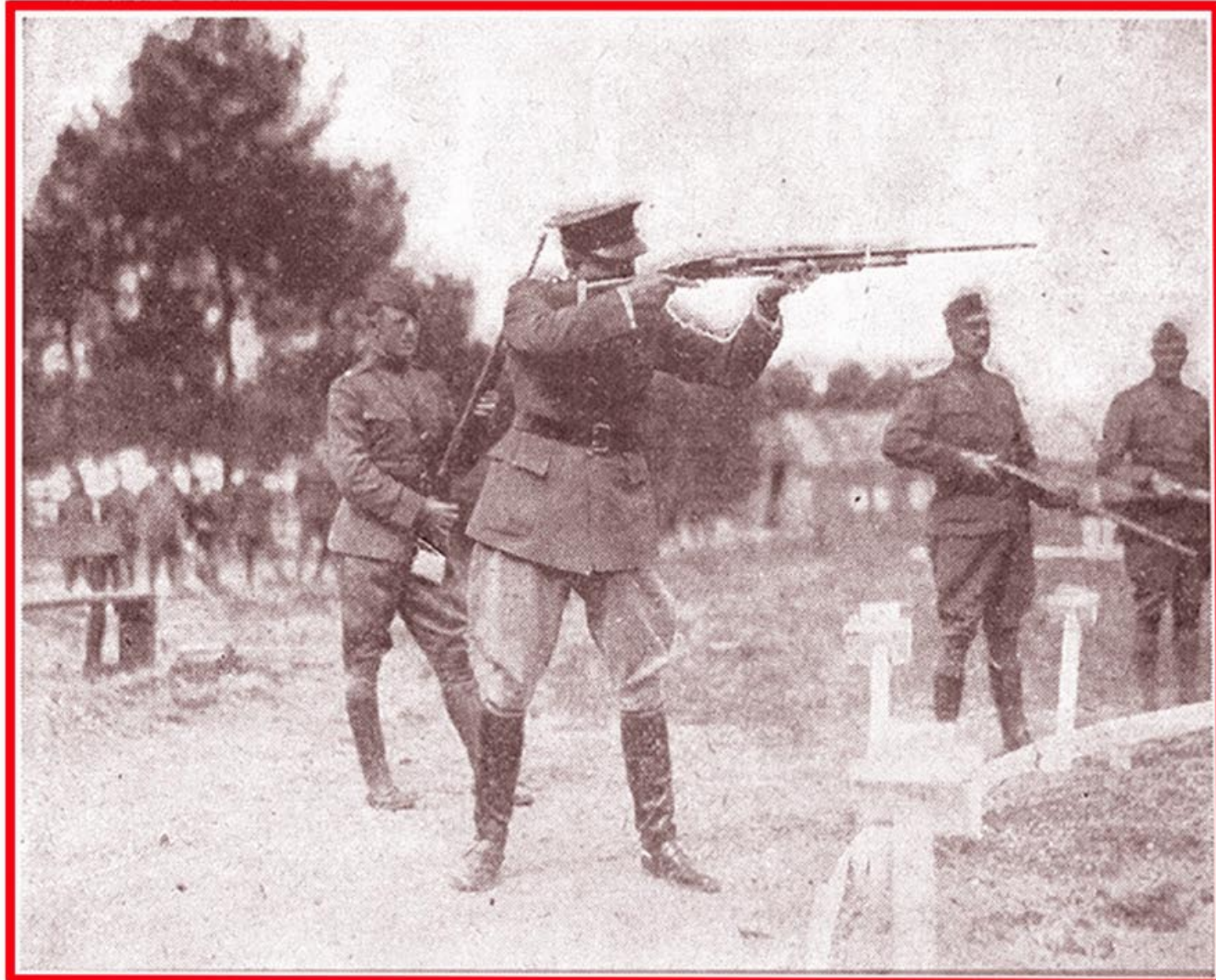
A hitherto unpublished picture of the General firing a repeating shotgun at a trap shoot near Le Mans, France, in June, 1919. He missed the first bird, but got the second

since the war. The orator erected an eloquent climax which he capped by quoting the General as having exclaimed: