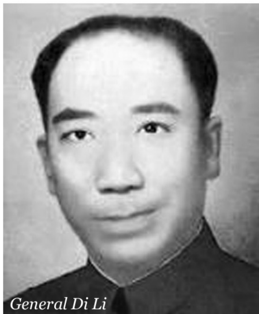
General Di Li