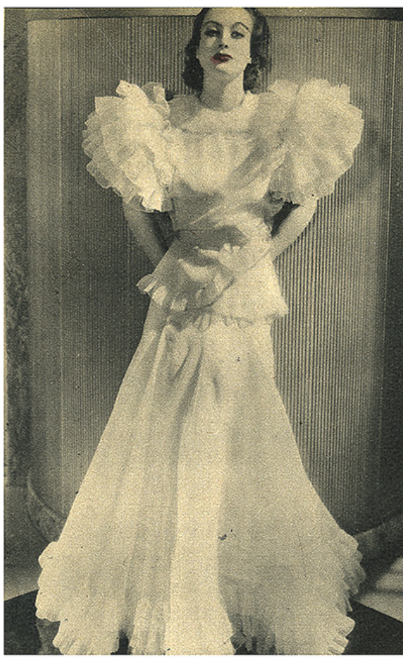
JOAN CRAWFORD'S "Letty Lynton" in 1932 touched off a craze of puff sleeve madness, still recurring.