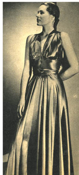
TODAY'S GLAMOUR girl in a new classically conceived gown.