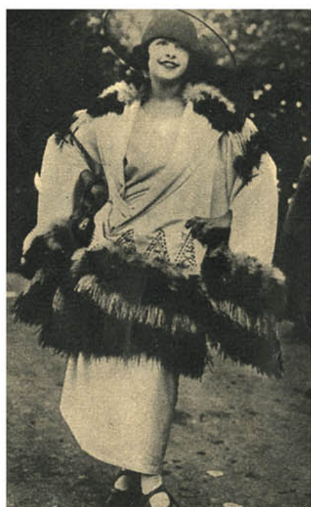
FASHION with ostrich fronds at the Paris races of another era.