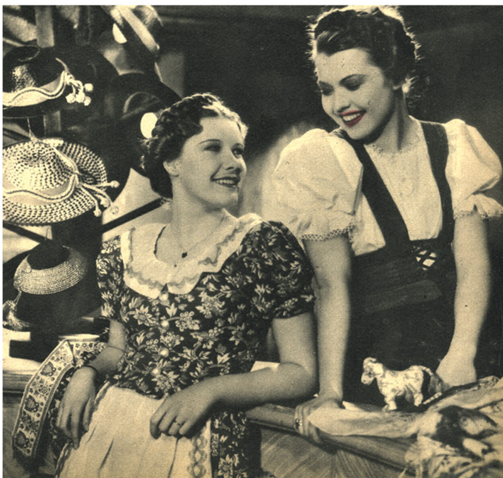
TODAY'S MADNESS is the Tyrol (right), Dirndl, and Scarlett O'Hara "influences." An experienced eye detects these dresses as 1938 "spinach."