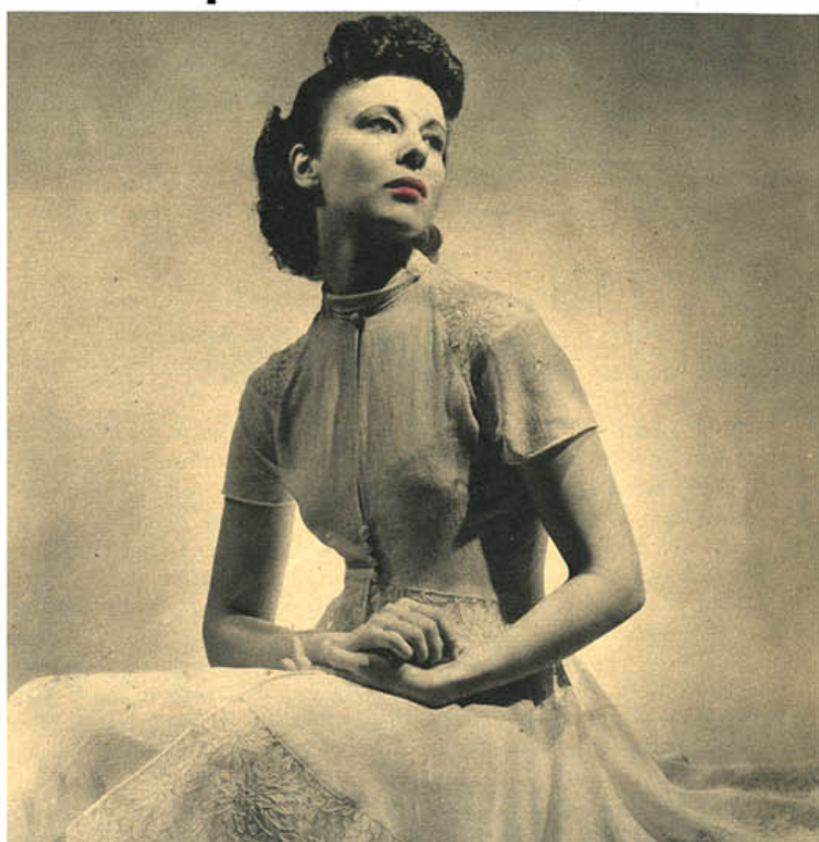
ANOTHER 1936 dress which has stayed in good taste because it did not follow the "spinach" of "fashionable trend" in trimming or cut.