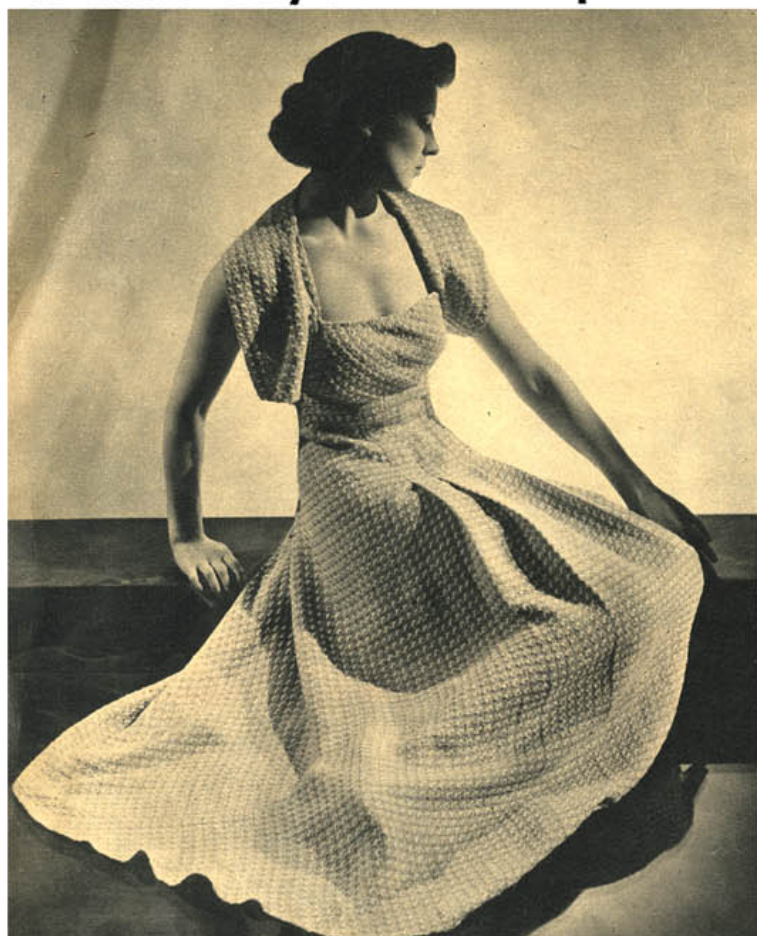
THIS SIMPLE dinner dress, designed in 1936, needs no gadgets to enhance its beauty and is, therefore, not vulnerable to fashion whims.