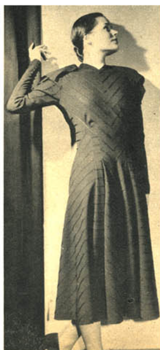
DISTINGUISHED lines void of gaudiness mark today's dress.