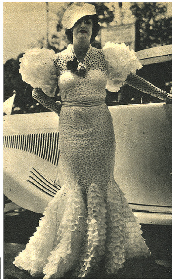
THE INFECTIOUS FASHION swept on in its most virulent form to the parade at the French race tracks.