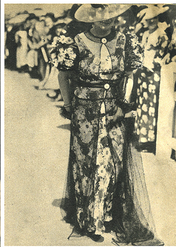
ONLOOKERS were merely amused by this display between races at Ascot, England, in 1936.