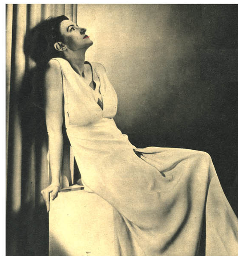
DESIGNER seven years ago this white evening gown was worn for four years and, in every detail of line, color and fabric, is in as good style today as when it was created. It is satin-backed crepe trimmed with vivid red and blue.