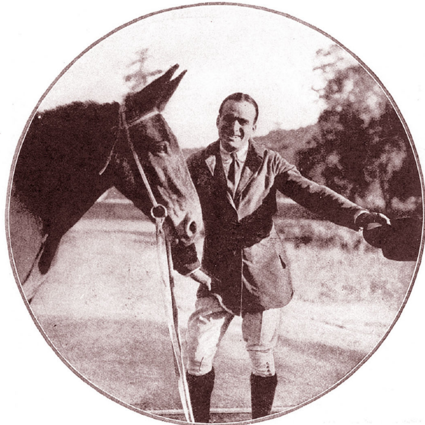
Reading from left to right—Douglas Fairbanks

F IRST of all, there's the movie heroine. She is invariably one of those excruciatingly sweet young things who once saw Mary Pickford and has never been herself since. She walks with the approved Lilian Gish movement, at a pace which would seem to indicate that she is always on her way to a fire. She never sits, in the accepted sense of the word,—she merely takes a running jump at a chair and lands girlishly on all fours, then draws her knees up on a level with her chin and clasps her hands vivaciously around them. Her hair is always worn in curls,—it's the unwritten law of the movies that all heroines, without regard to age, race, color or creed, must wear their hair in curls. So far as movie heroines are concerned, there is no other coiffure.