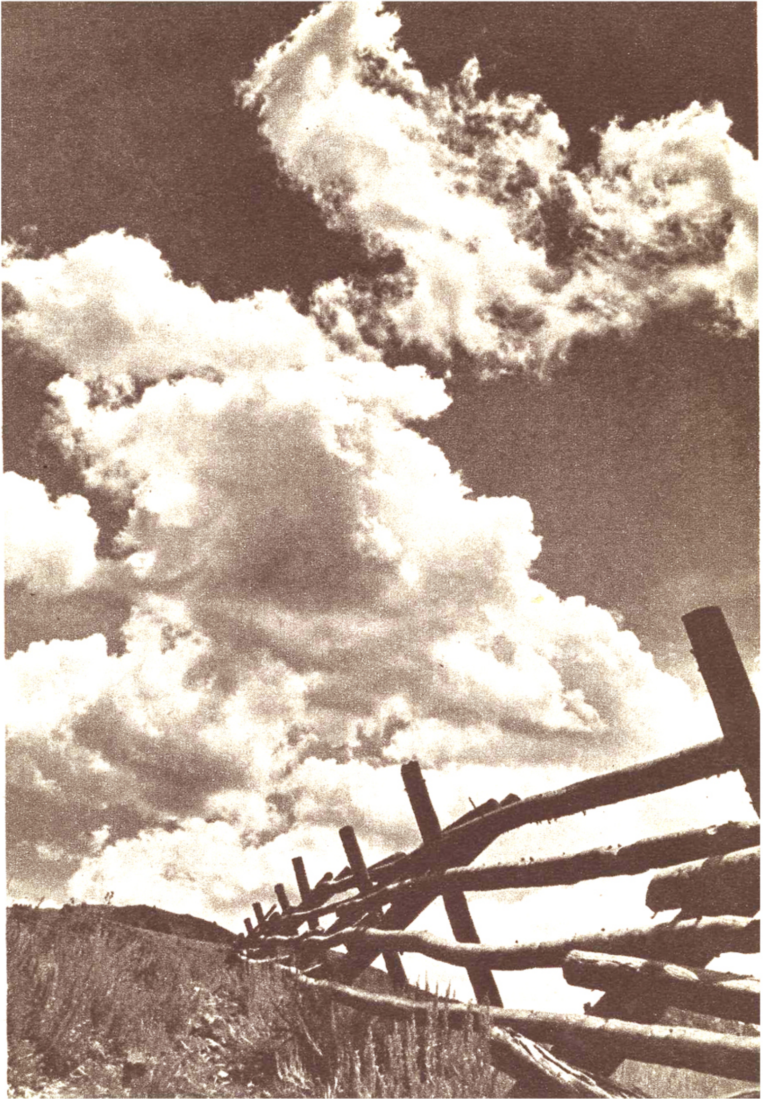
This is the A-Bar-A Ranch in Wyoming. The cloudscape shows Krainin's versatility.