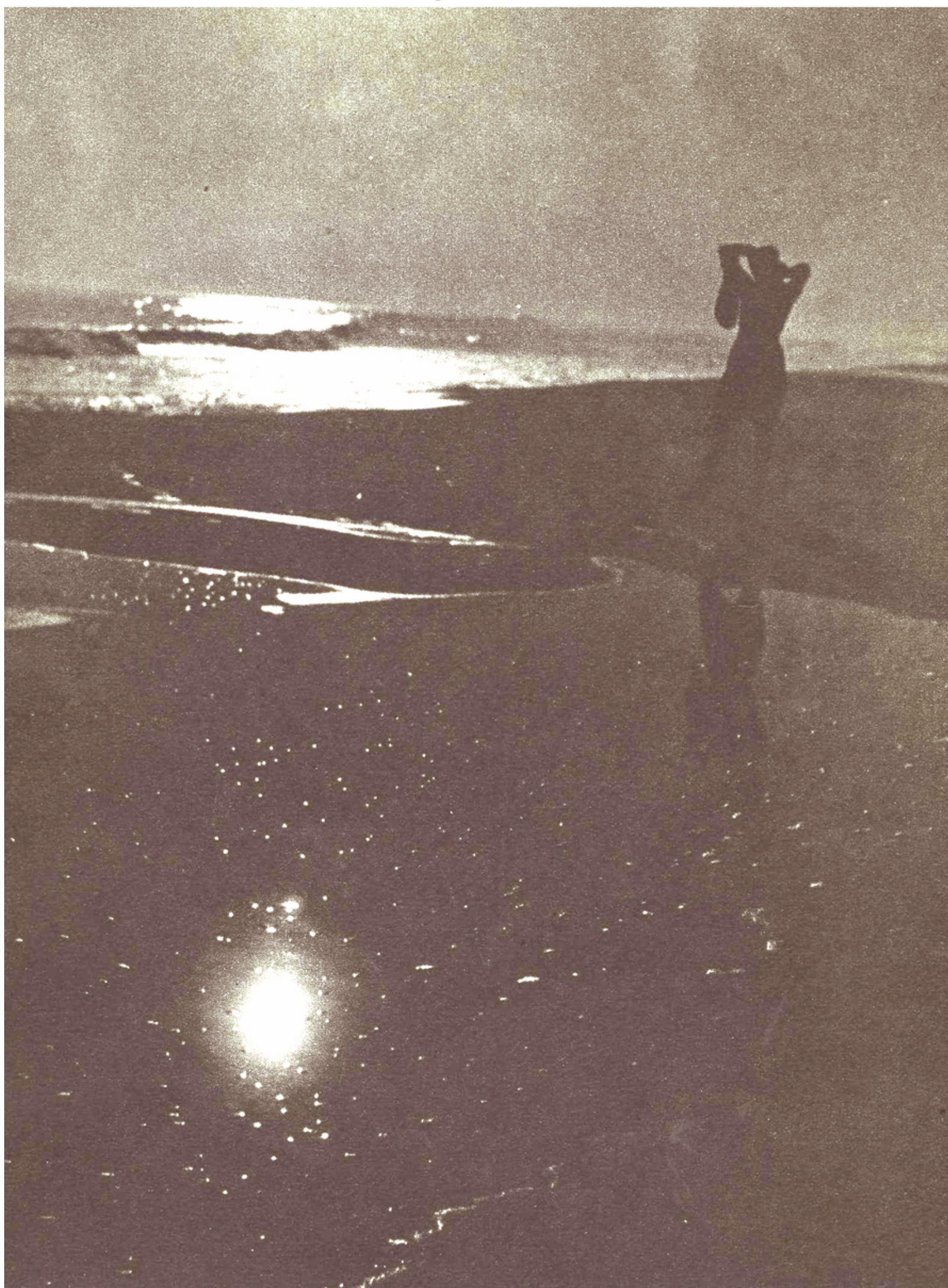
Damien Shaw stands on the Bermuda beach at sunset. Still another Krainin mood.