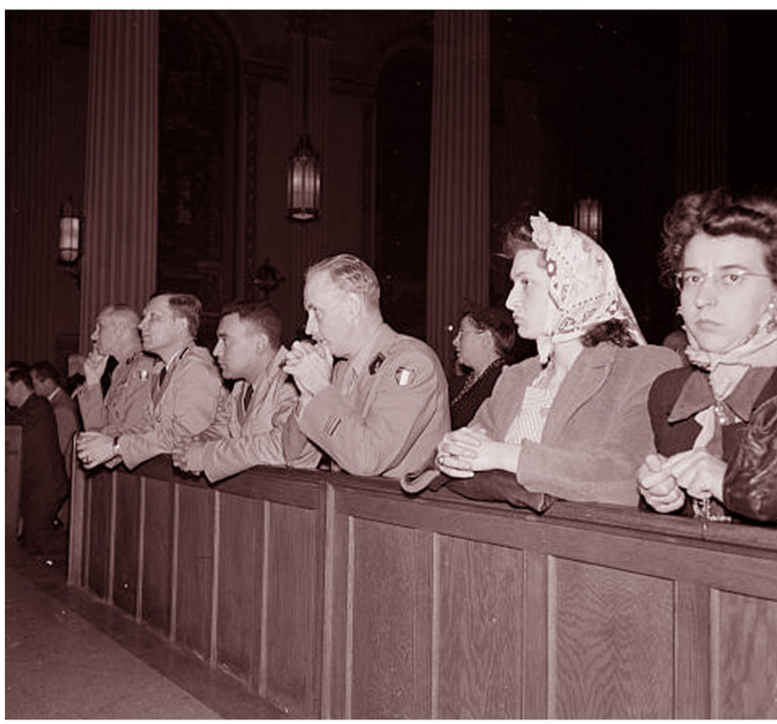
D-Day services at Saint Vincent De Paul Church. New York City

Subdued Home Front Sees Invasion as Hazardous Launching, Not as Celebration Signal