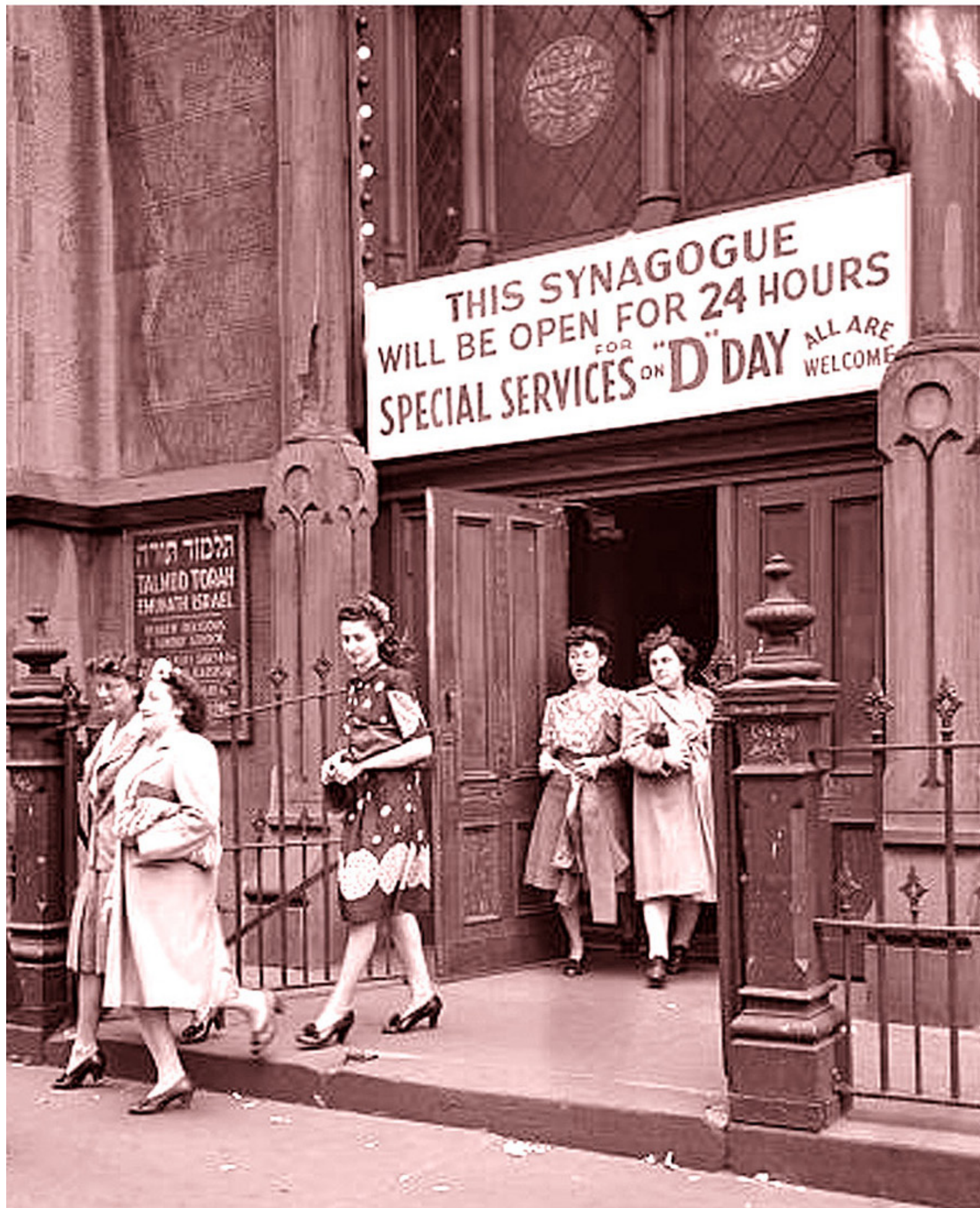
D-Day Synagogue Services, June 6, 1944

On the evening of D Day, President Roosevelt led a radio audience estimated at 100,000,000 in a prayer of his own composing: "Our sons, pride of our nation, this day have set upon a mighty endeavor . . . Lead them straight and true . . . Their road will be long and hard . . . Some will never return. Embrace these, Father, and receive them."