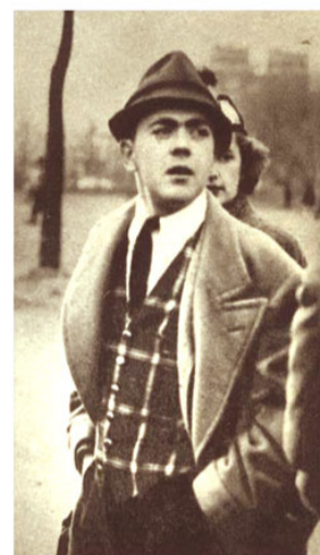
The Tyrolean-shaped small brimmed hat . . . The Tartan odd vest trimmed with gold color metal buttons.