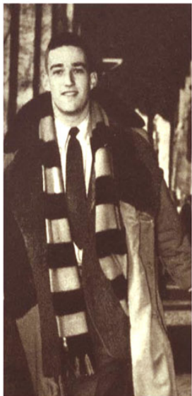
The wool six-foot muffer with fringed ends, horizontally striped in many school colors.