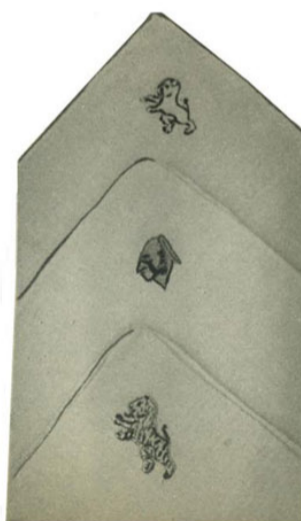
Miniature mascots (shown here: Yale Bull, Dartmouth Indian, Princeton Tiger) embroidered in school colors on white linen handkerchiefs by International Handkerchief.