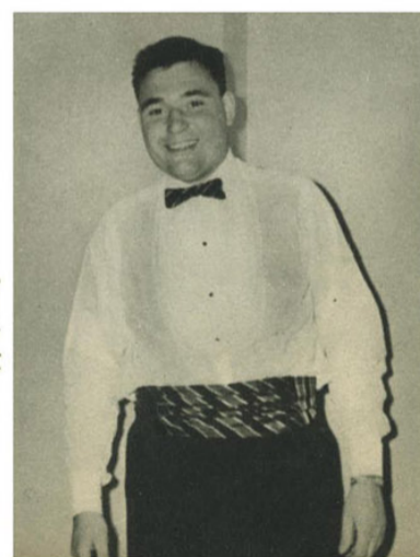
The striped rep matching tie and cummerbund . . . the small bosomed, very lightweight dress shirt for dinner jackets.