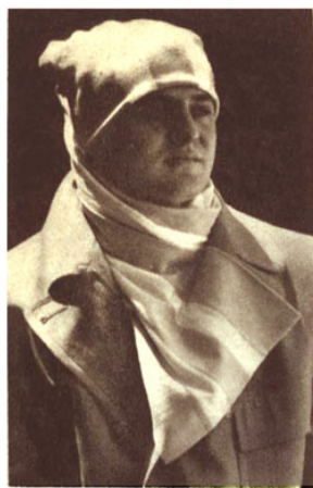
From Jaeger of London . . . the new wool muffer-toque. Can be worn stocking cap style, as shown, or conventionally around the neck.

ACCESSORIES . . . some add a touch of color . . . others combine functionalism with good looks. Already accepted, or new this season . . . all in good taste.