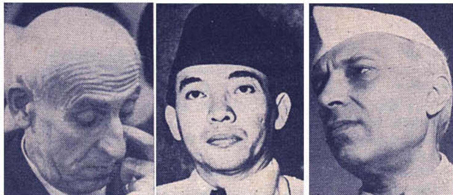
"Honest men" of Asia: Mossadegh, Soekarno, Nehru (l. to r.)

Pleas to these people to arm and defend against communism are largely empty. For any change often looks good to them—even a change to commu-