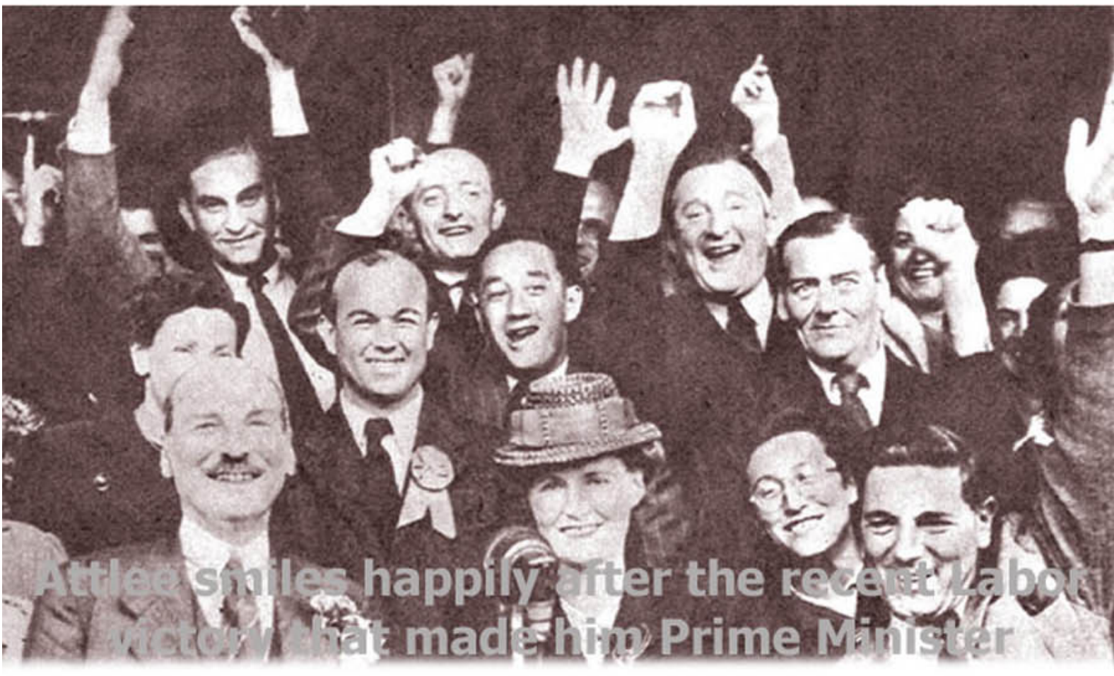
Attlee smiles happily after the recent Labor victory that made him Prime Minister

Nobody was more surprised at the explosive 1945 election than the winners. Whatever success the Labor Government may have in reconstructing Britain, there is no doubt that the people are behind it.