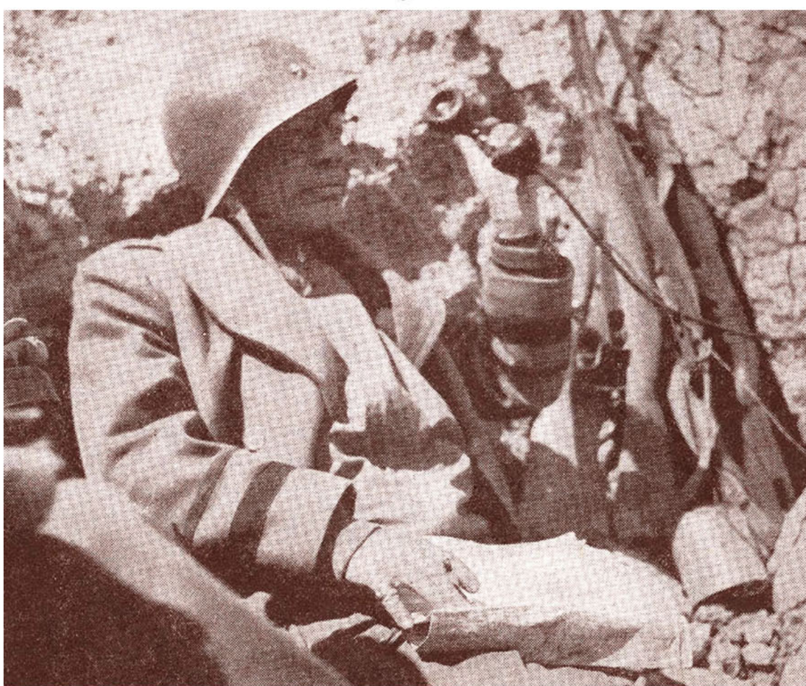
Here is Brigadier General Theodore Roosevelt, who always turns up in the hottest spots, posing for Collier's photographer in an advanced infantry command post

An American gun crew, awaiting orders, kills time with a card game, while one man, with headphones, keeps in touch with the command post. The game they're playing wasn't identified (could be blackjack)