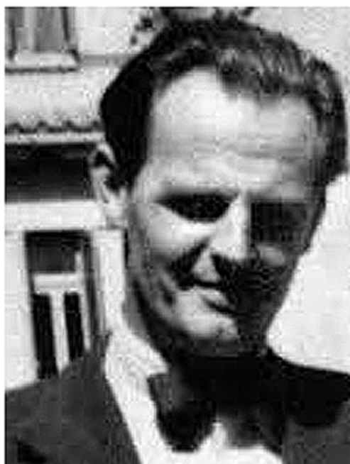
Donald D. MacLean

Background: The disappearance of two British foreign service men, D. D. MacLean and Guy Burgess, upset the State Dept. Both men had access to confidential U. S.-British diplomatic files, although not to top secrets. Even if they hadn't gone over to Russia, their mysterious disappearance on a "holiday" shook official U. S. confidence in their eligibility to handle high policy papers of the two Allies.