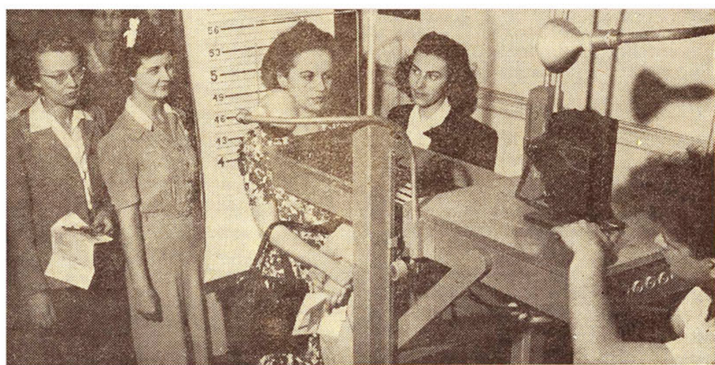
2 Identification photographs are snapped of each applicant. Picture will indicate girl's height, show identifying serial numbers. British women have done yeoman service repairing warships.