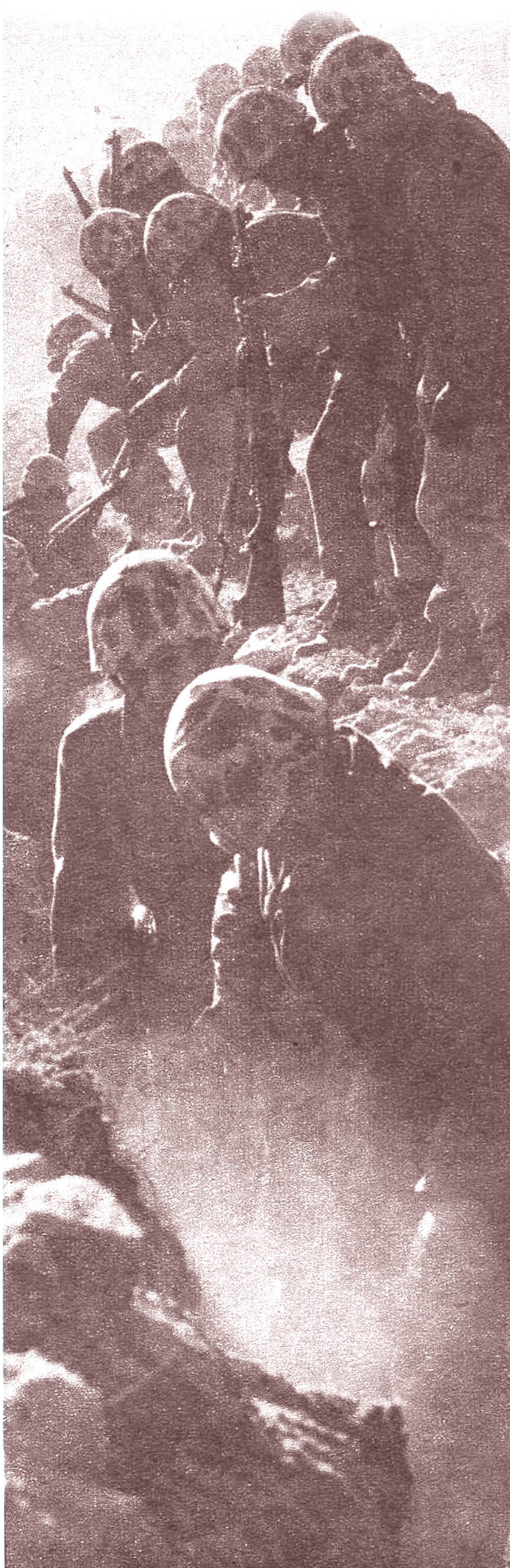
Infantrymen dropped into the trenches preparatory to setting off of A-Bomb.

In the beginning there was none of this excitement. In fact I felt rather detached when I was informed I was to be included in the personnel observing a Nevada Test Site atomic explosion. My job was to assist in testing radiological safety gear and procedures for decontamination. Before leaving my base I'd had to bone up on procedure and attended daily lectures and advanced instruction until my head was swimming.