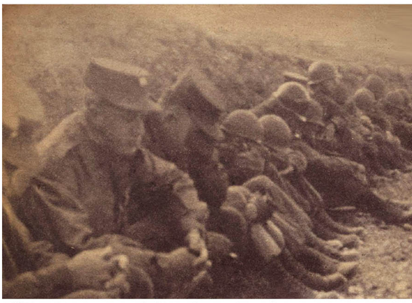
The men participating in the test sat in an open trench with their backs toward ground zero as the big flash whitens sky. Trench is 3500 yards from the zero spot.

This awesome scenery I learned, was the results of a previous A-bomb test, and even as I stared I saw a Sherman tank collapse suddenly in a pile of rubble as one of the supports keeping it standing gave away. The clatter sounded like a pile of scrap metal being moved. It was then I felt the probing finger of fear in my vitals. The classroom was too far removed from the actual scene and during instruction I would find my thoughts wandering often. But here I knew this would never occur.