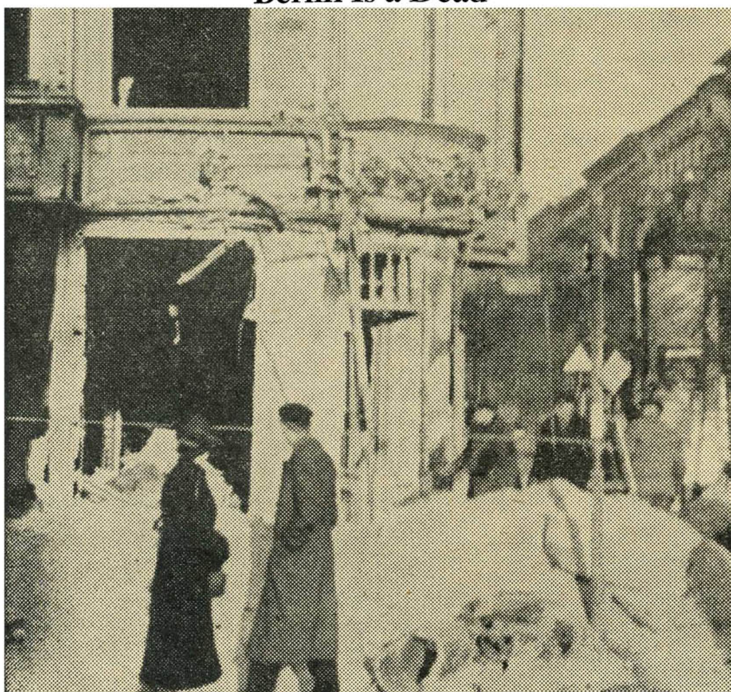
"Their chief terror was bombing attacks." This is an RAF hit on Tanentzeinstrasse, Berlin.

This sullen, gloomy air could be felt at the Esplanade, a first-class hotel. The people appeared to be working people, who left early in the morning and returned late in the afternoon.