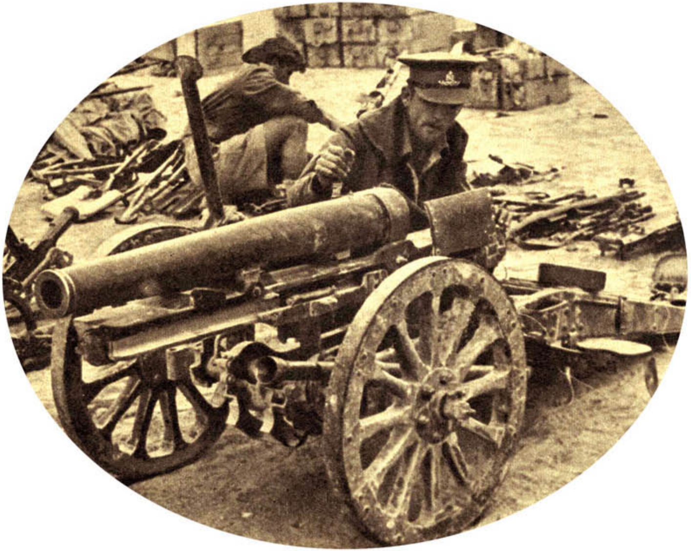
BRITISH OFFICER CAREFULLY CHECKS BREECH OF AN ARTILLERY PIECE ON BATTLEFIELD. HIS ANALYSIS REPORT WILL ACCOMPANY GUN BACK TO AN ALLIED ORDNANCE CENTER

function long before American experts know just what makes them tick, develop measures to counteract them. Abandoned Nazi tanks, Jap Zeros crashing inside our lines, eventually divulge their innermost complexities to eager U. S. Ordnance engineers dedicated to saving the lives of our American land and sea fighters.