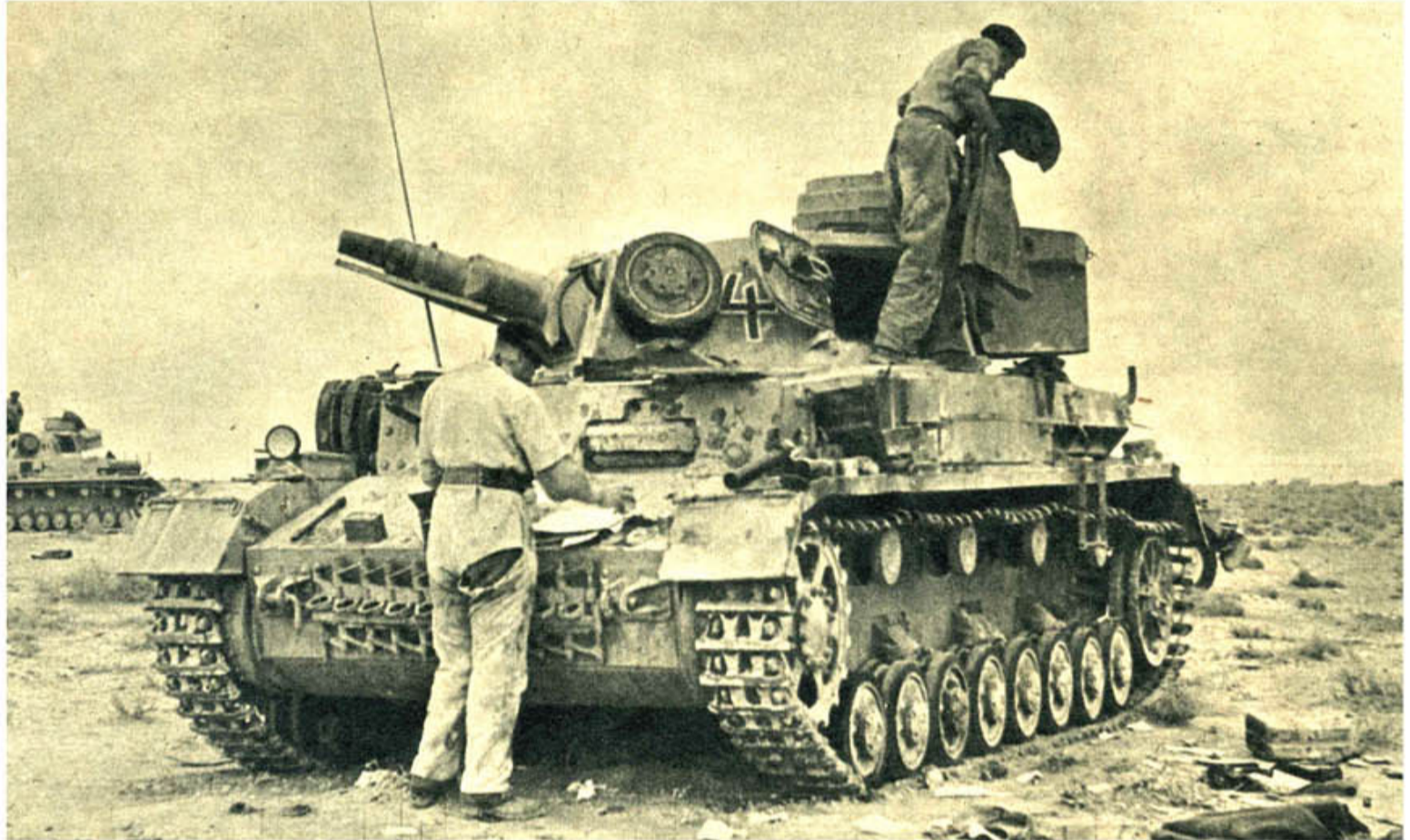
ALLIED SOLDIERS IN WESTERN DESERT GIVE CAPTURED GERMAN TANK THE THIRD DEGREE, COLLECT VALUABLE DATA CONCERNING ITS STRONG AND WEAK POINTS