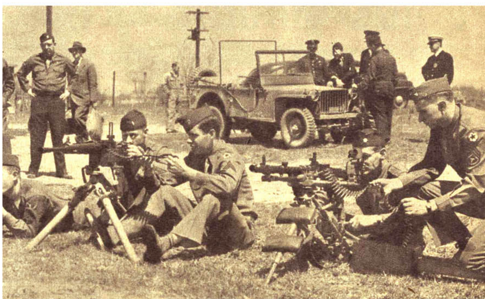
LIGHT MACHINE GUNS ARE EXAMINED BY ABERDEEN PROVING GROUND TECHNICIANS

D ESIGNED originally as a deadly anti-aircraft weapon, Germany's highly-touted 88-millimeter cannon proved equally destructive against English tanks and infantry. At Bir Hacheim and elsewhere on the embattled African Desert last year, this lethal, all-purpose gun smashed British Valentine and Crusader tanks to bits, contributed more than any other single factor to Rommel's rout of the gallant, but hopelessly out-classed Eighth Army, paved the way for his irresistible advance to the gates of Alexandria.