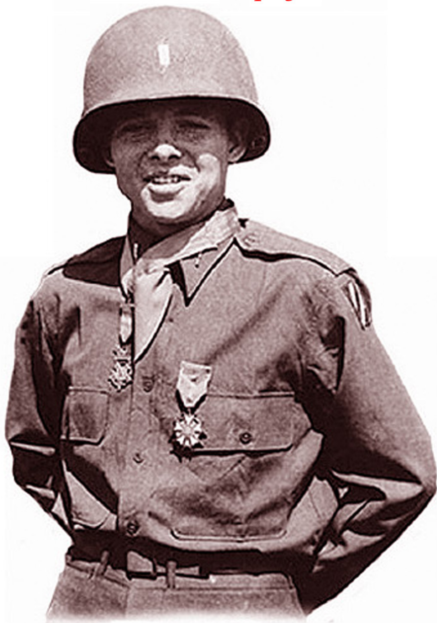
1945: awarded Medal of Honor.