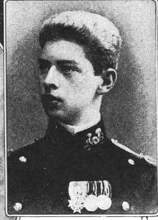
Crown Prince Charles of Roumania

I T HAS been announced in diplomatic circles, that a future alliance of the Balkan peoples, who have been at war for the past year and at odds for many years in the past, is to be cemented by the marriages of Crown Prince George of Greece to the Princess Elizabeth of Roumania; and of the Crown Princes of Serbia and Roumania to Olga and Tatiana, the daughters of the Czar. These inter-marriages, it is hoped, will help end the bitterness between the nations. The Karageorgevitch family of Serbia is not related to big European royalties, but it is looking for a rise in the world. Montenegro got one when Helenea married Victor Emanuel of Italy. Her sisters and cousins will not envy the Russian Grand Duchess who is assigned to Belgrade.