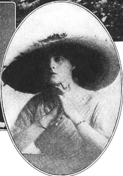
Princess Elizabeth of Roumania