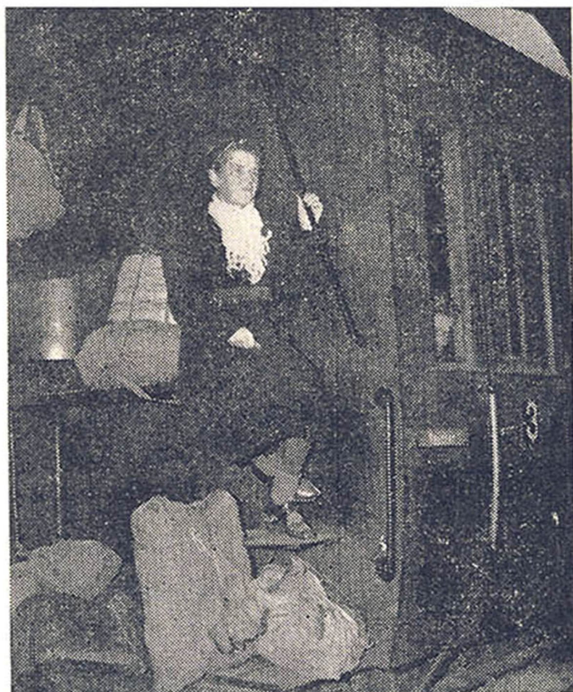
DISPLACED GERMAN Chief source of unrest

youth is growing disorderly, demonstrating against the friendship between German women and American soldiers. Handbills threatening "faithless" German girls have appeared. An occasional U. S. soldier has been attacked. Nowhere has smoldering unrest flamed into general disturbance, but occupation leaders wonder if it will come as the winter privation grows sharper and the restless people grow bolder.