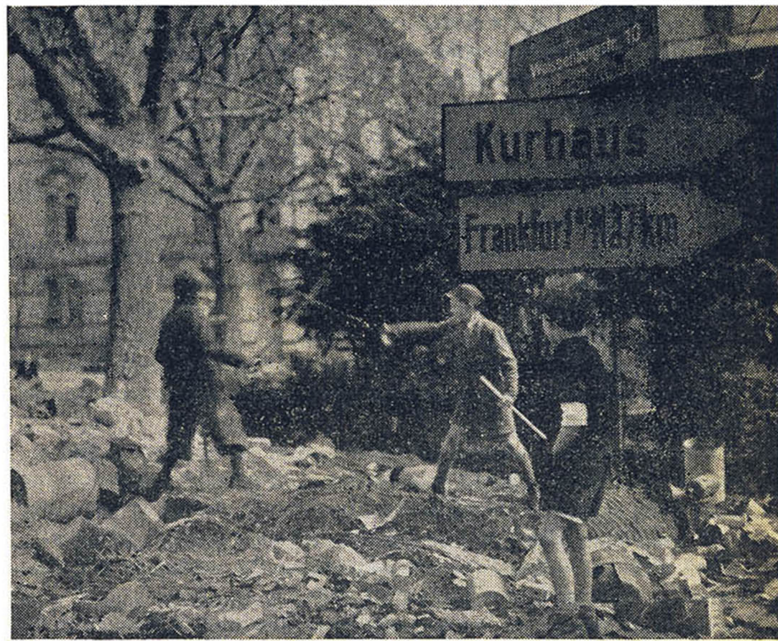
BOYS PLAY WITH NAZI SWORDS

... life for the German is bleak—for his conquerors, perplexing