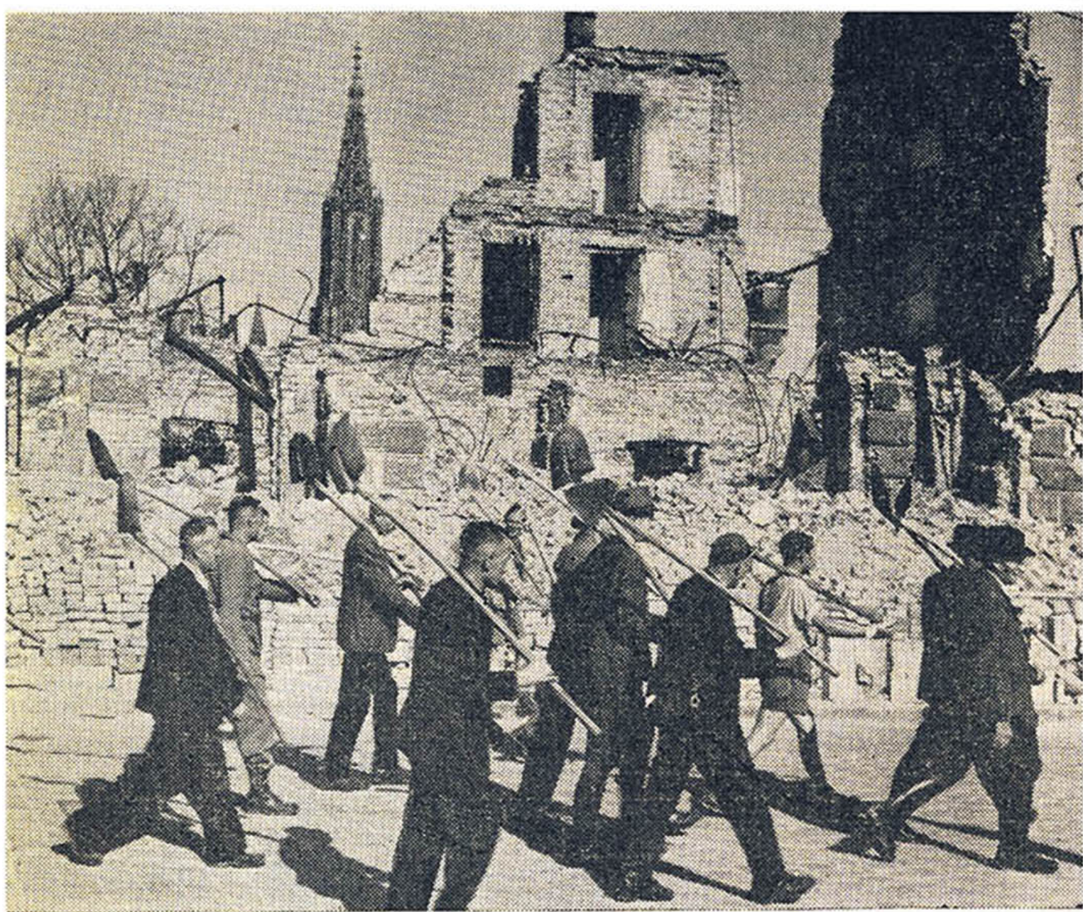
NAZIS WORK WITH SHOVELS