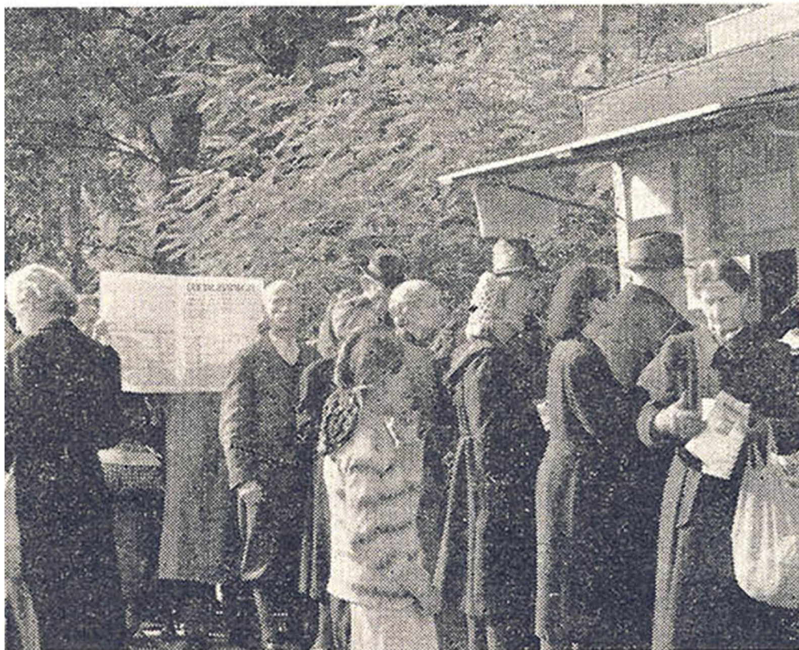
FREE PRESS REBORN IN GERMANY ... limited editions only

The day when Germans will govern themselves still is far away. Until then, they must live under enemy occupation. Here is a view of that life after six months: