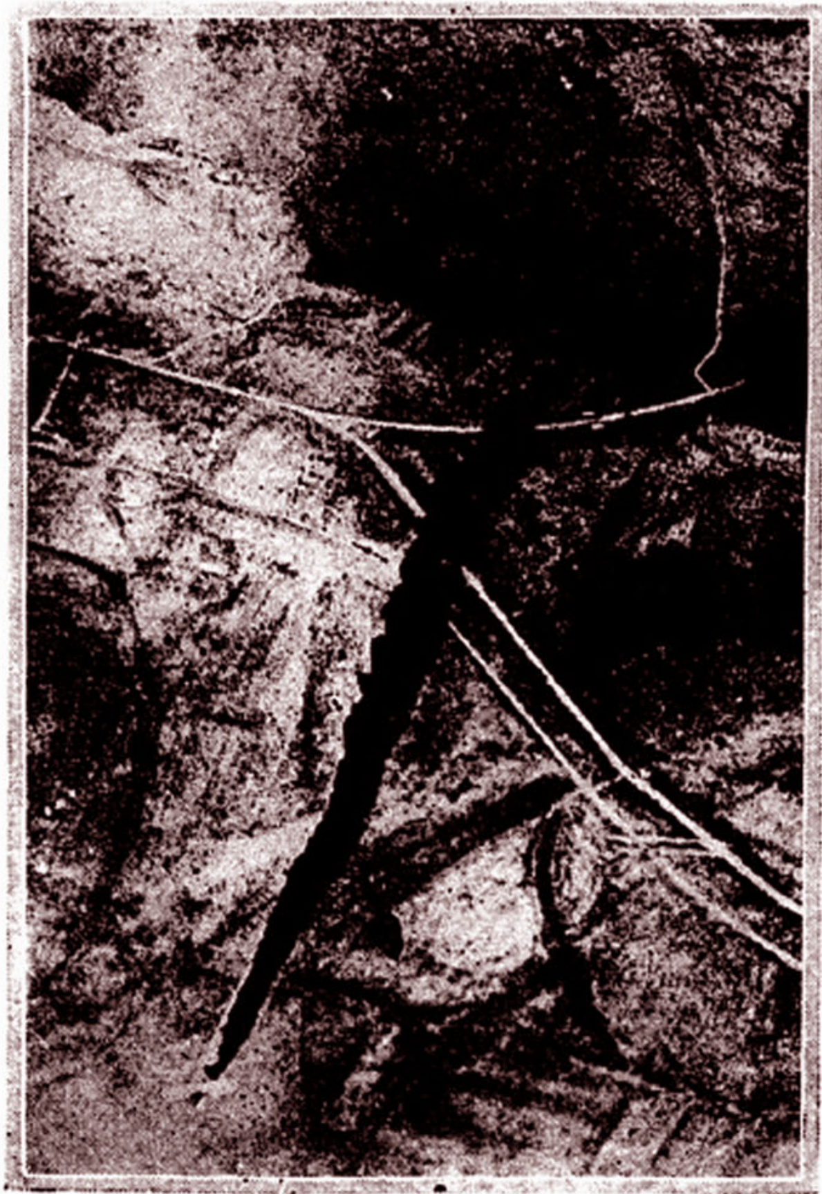
A TRAGEDY OF THE AIR

Even now, to the uninitiated, the glossy and finished prints taken from the aerial negatives would appear thoroughly unintelligible. But frequent study and application enable one to wring out from the minutest details in the prints the truth which the Hun would conceal. He tries to do this by camouflaging all his emplacements, or by building dummy emplacements; but he must be very skillful indeed, to deceive the camera.