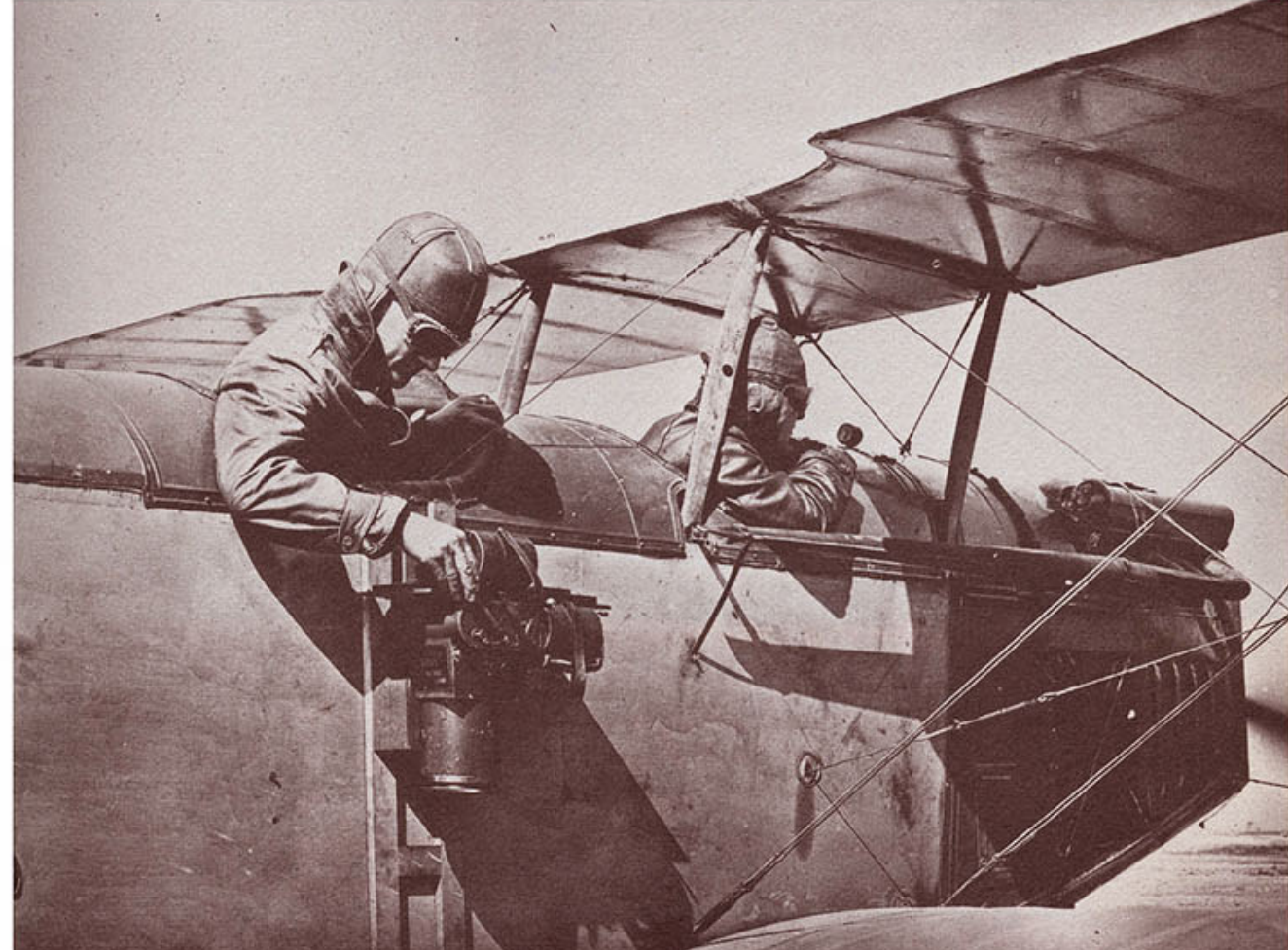
Method of attaching a camera to an airplane. The pilot is sitting in the front seat, and can operate the camera at the same time as the machine