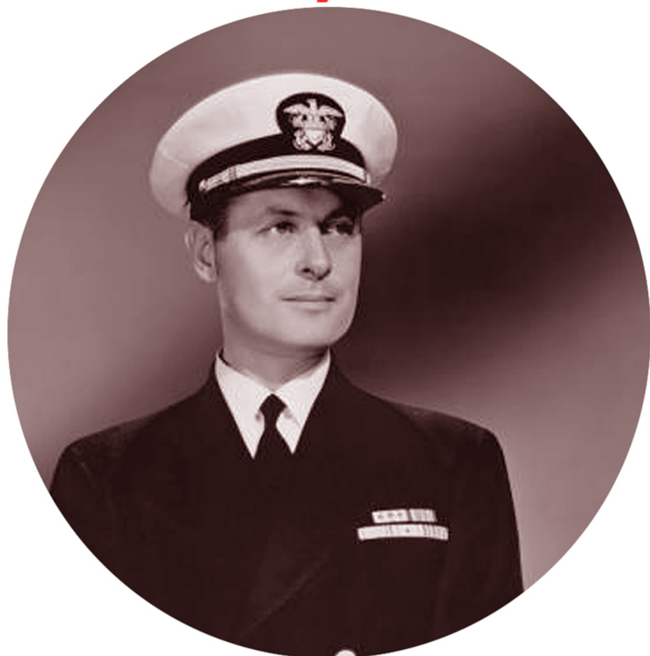
Lt. Robert Montgomery U.S.N.

Because of that feeling, Washington must take the lead. The time has come for Washington to proclaim the movies an essential industry, exactly as necessary as steel and coal and ships and farms. That is not merely a flowery statement. It is the plain truth that must be recognized.