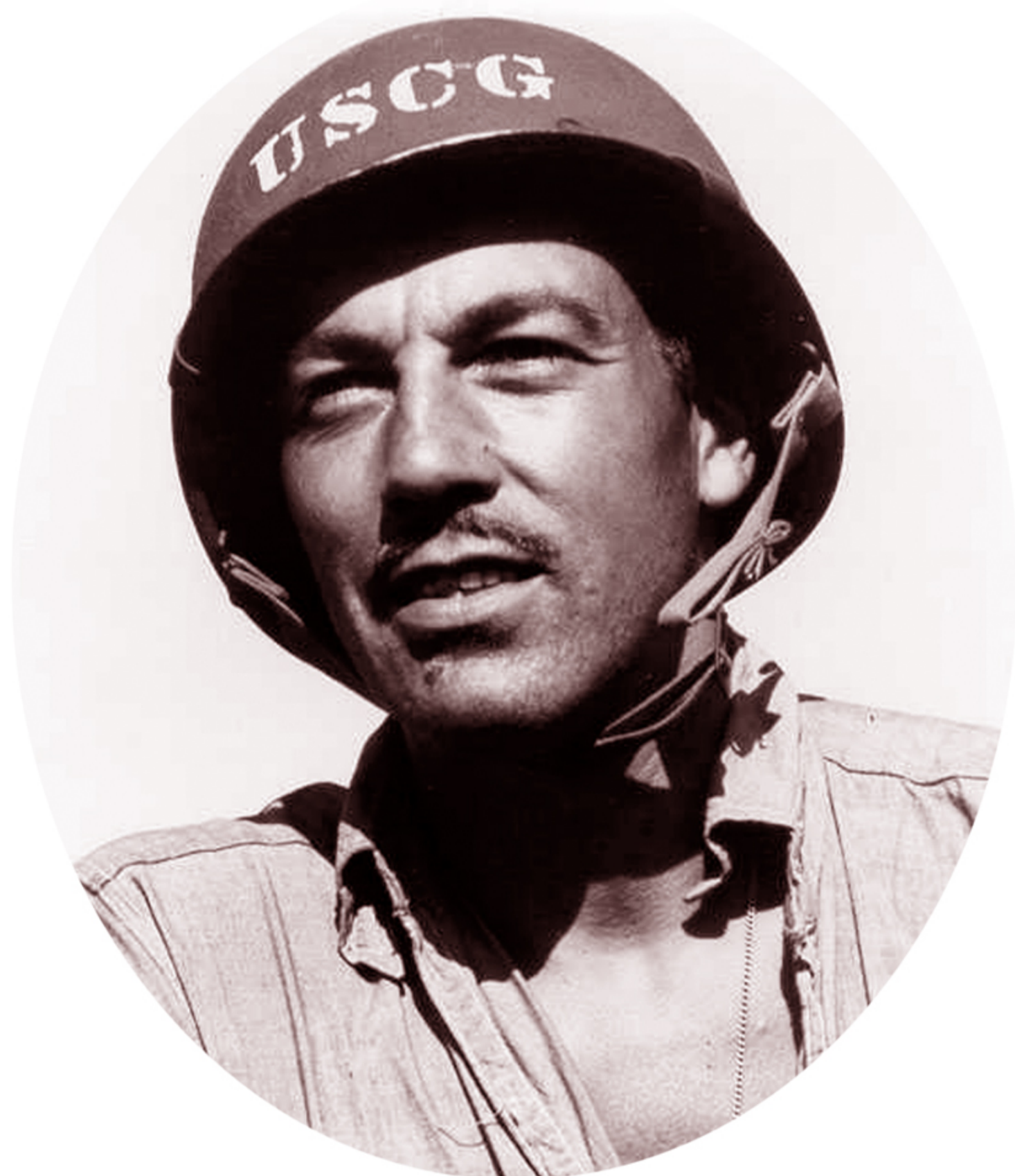
Cesar Romero Seaman, Coast Guard Reserve

The job is to make the best pictures in the world and to keep on making them. Putting the problem in its simplest form, Clark Gable shouldn't be allowed to be a soldier. War is too serious for us to be playing sentimental games. He has a duty and Hollywood has a duty and they should be made to stick to it. ★★★