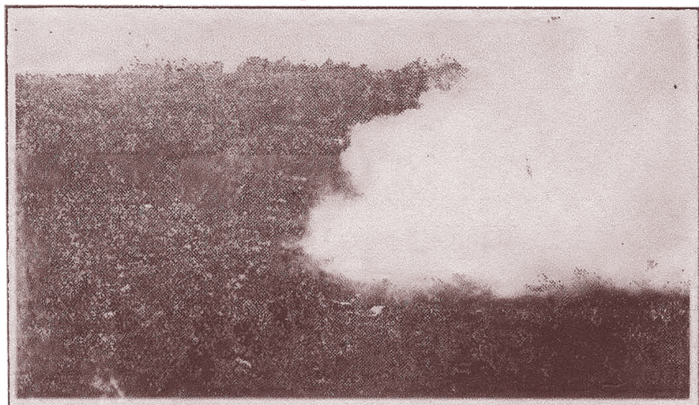
A battery of Livens gas projectors being tried out at Chaumont

It was a tough job. The nature of the work was graphically described by a Yankee buck, who said in a moment of disgust: "This is a job for grave diggers, hod carriers and piano movers, instead of chemists, pipe fitters and mechanics."