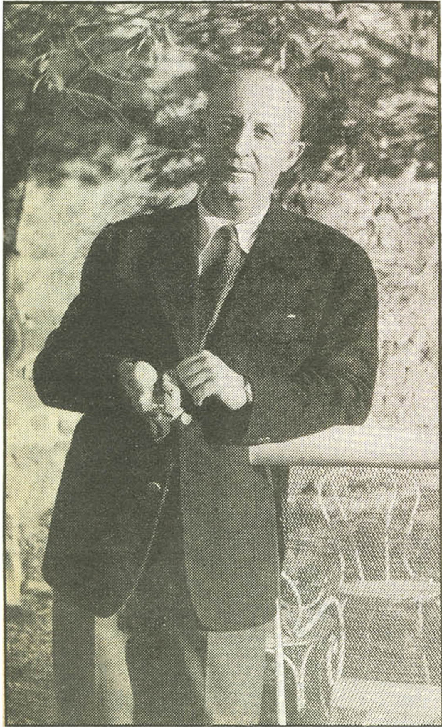
King of fashion. Christian Dior, the highest star in the haute couture.

In a land which encourages bizarre originality, it is not surprising that all of the 11 broke in as amateurs. Fath, who locks himself up for a month to create a collection and uses his own body at times for draping fabrics, was once a financier on the French equivalent of Wall Street. Schiaparelli, the only woman member of