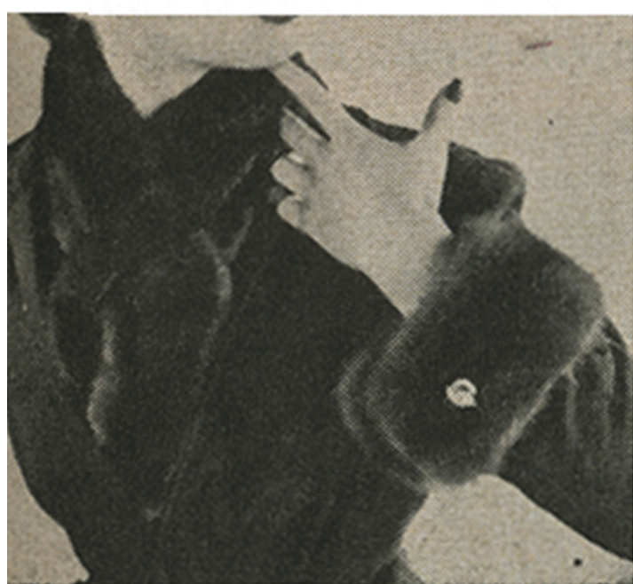
Detachable from suit: mink-dyed squirrel ascot, cuffs

FURTHER EVIDENCE of the importance of the Italian couture ( QUICK , Aug. 13) was noted when the giant U. S. fabric firm, Cohama, sent its stylist to Italy. Result: A New York City fashion show of 35 resort costumes in Cohama fabrics by leading Italian designers.