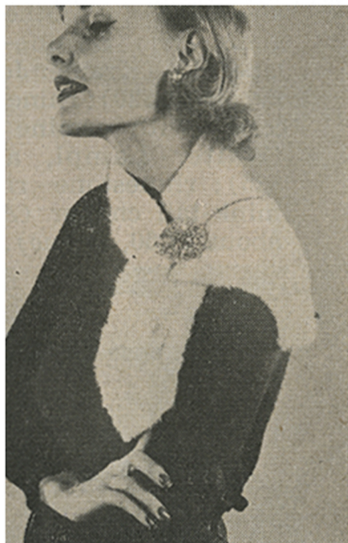
Pieced white mink furrykin fits working girl budgets.