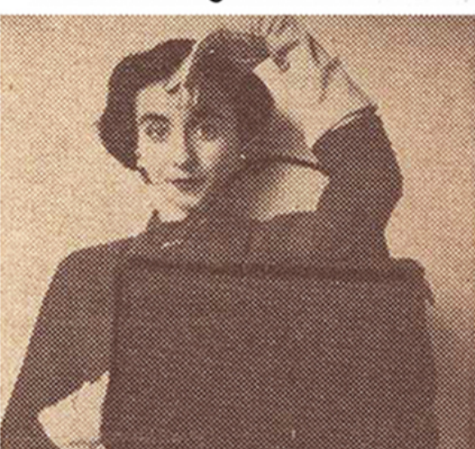
Hands in a fur handbag