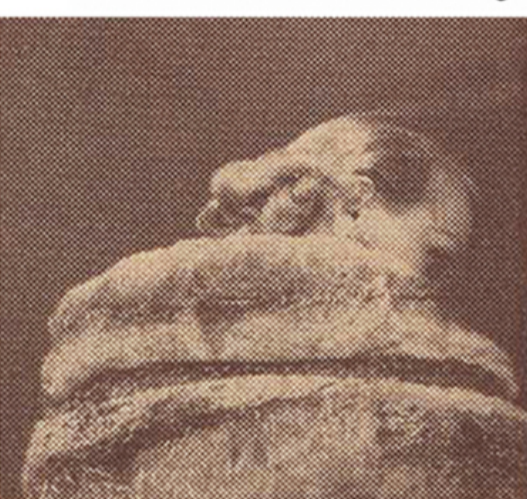
Chinchilla on black lace