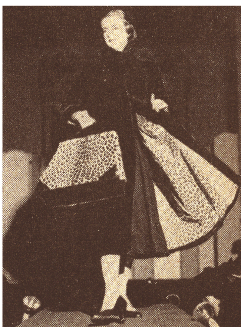
Sealskin coat, leopard-print silk lining, leopard satchel.

● Show-piece de luxe: Little Red Riding Hood in ermine cape with a ruffle of ermine tails.