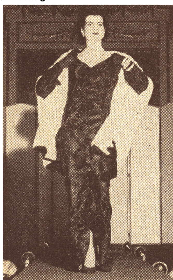
Russian broadtail dress; cape that reverses to ermine.