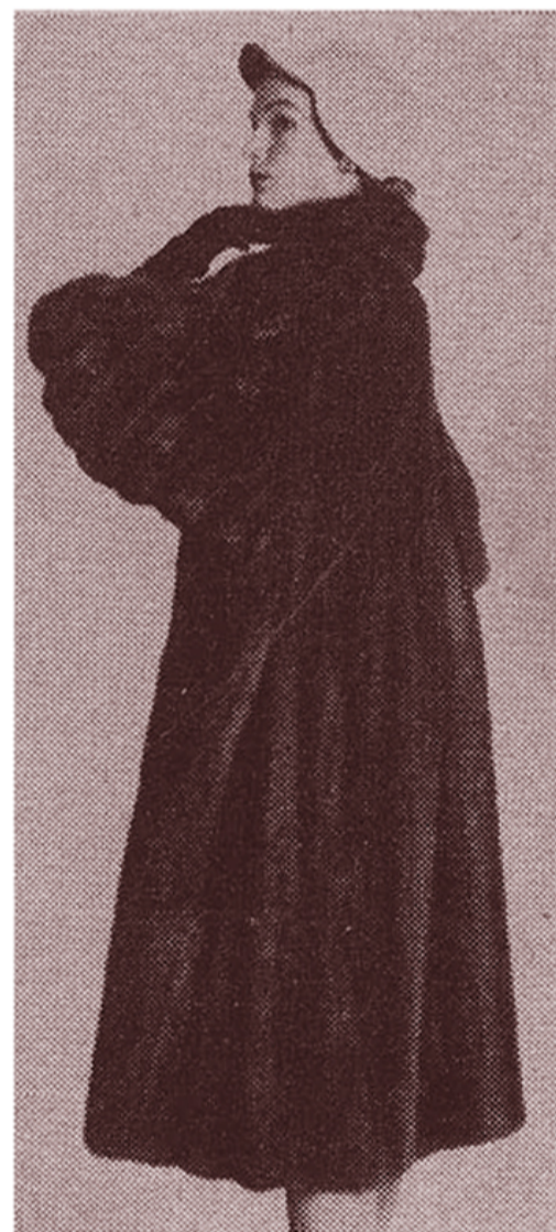
Side pleats for gradual flare; ranch mink (Ritter)