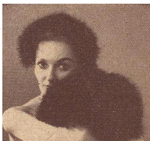
Fox evening hat and muff

Home-grown chinchilla (said to be finer than the Andean type and not nearly so costly) made one of the wonderfully "wrappy" new little furs ( r. ), especially supple because the skins were set on black lace (Esther Dorothy).