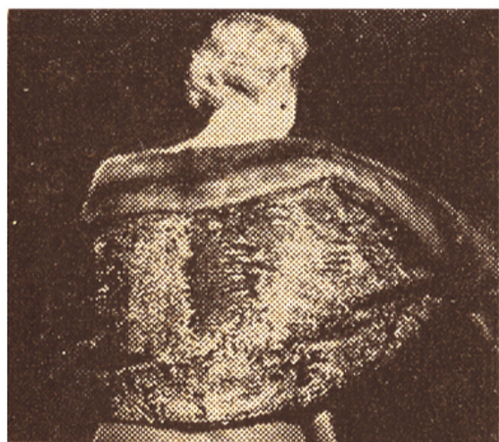
● Reversible mink and Russian broadtail cape-stole.