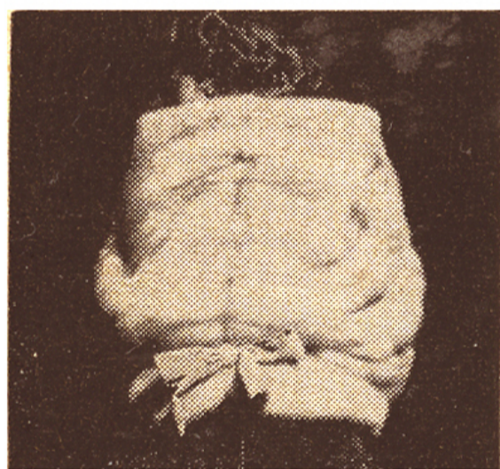
● Bow-tied mink cape.

● Show-piece de luxe: Little Red Riding Hood in ermine cape with a ruffle of ermine tails.