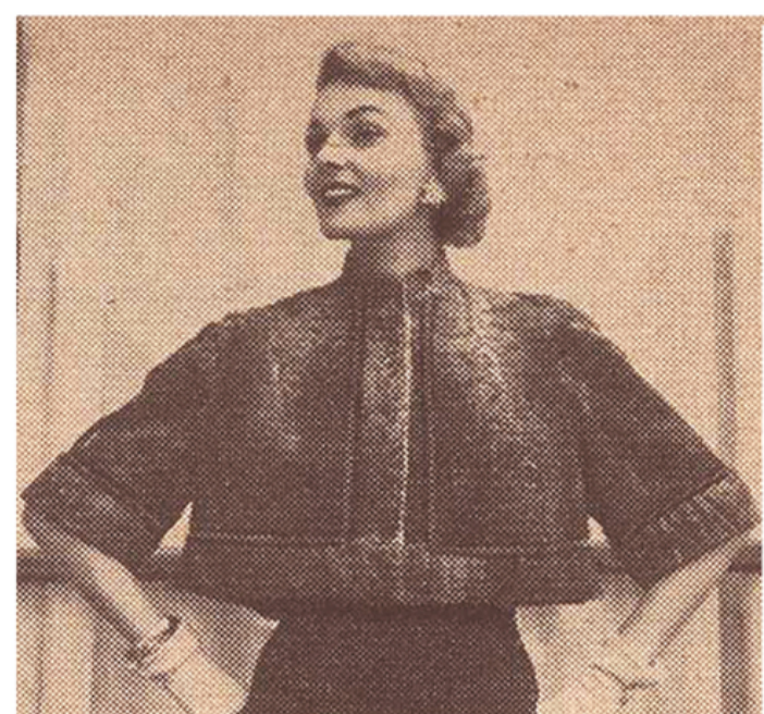
Ornamental pockets, Furbelows