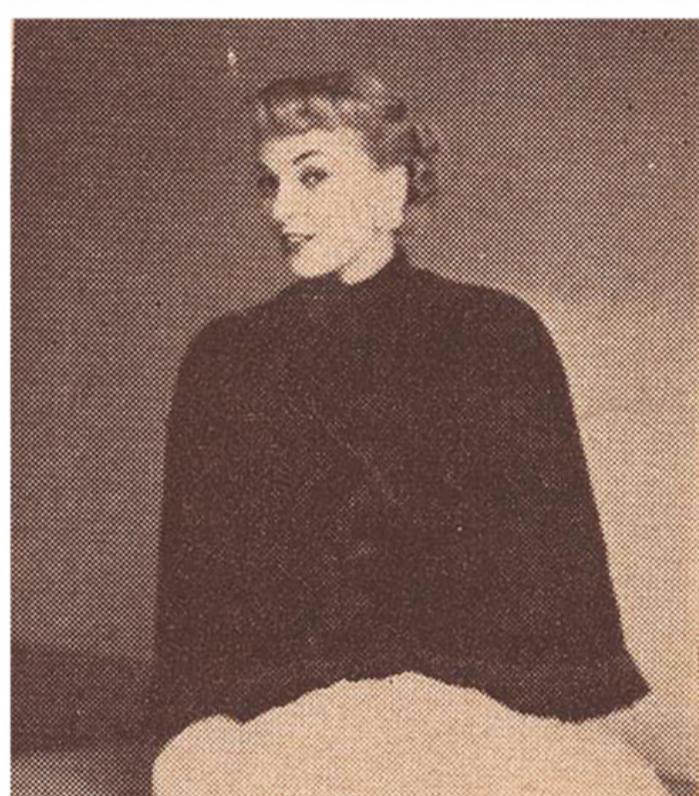
Fringed seal from Fredrica