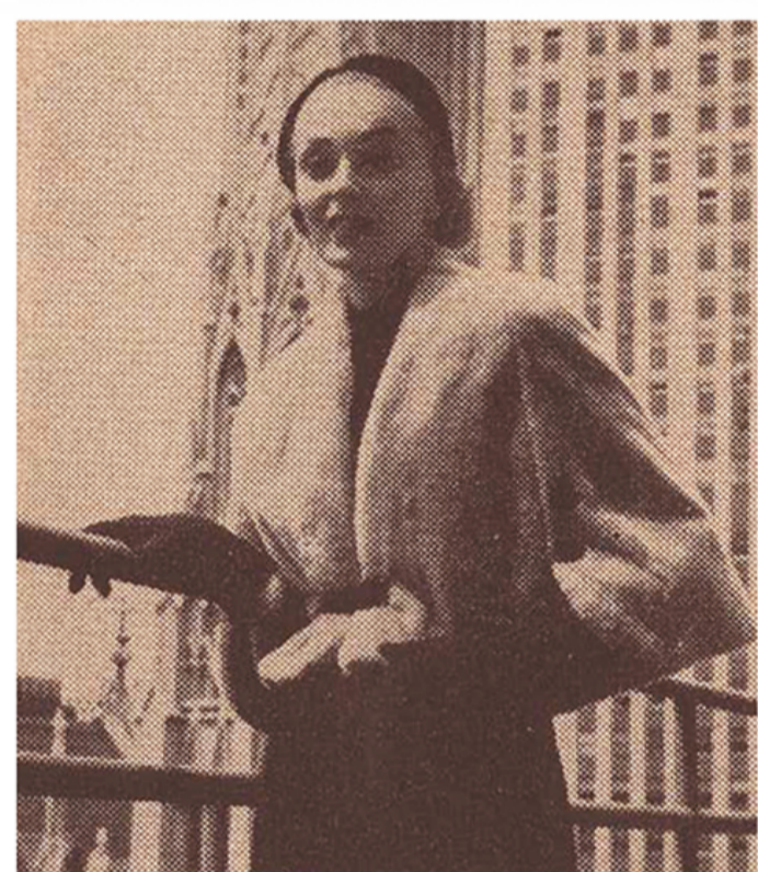
Belted nutria, Ritter Brothers

NO MORE WOLVES IN SHEEP'S CLOTHING. As a result of the new Fur Products Labeling Act, furs in the shops now had the animal's identity plainly marked on a big ticket. Example: "Blue River Otter; country of origin, Canada," at fashionable furrier Maximilian. Further news: Full-length "stable sable" (domestic) coats, promoted by Ritter for all-around wear. Short fur jackets ( above ) and capes ( below ) became suddenly important for fall, trimmed like suits . . . and full-length fur coats were pleated like cloth—releasing a gradual fullness climaxing in the tulip line ( opp. p. ).