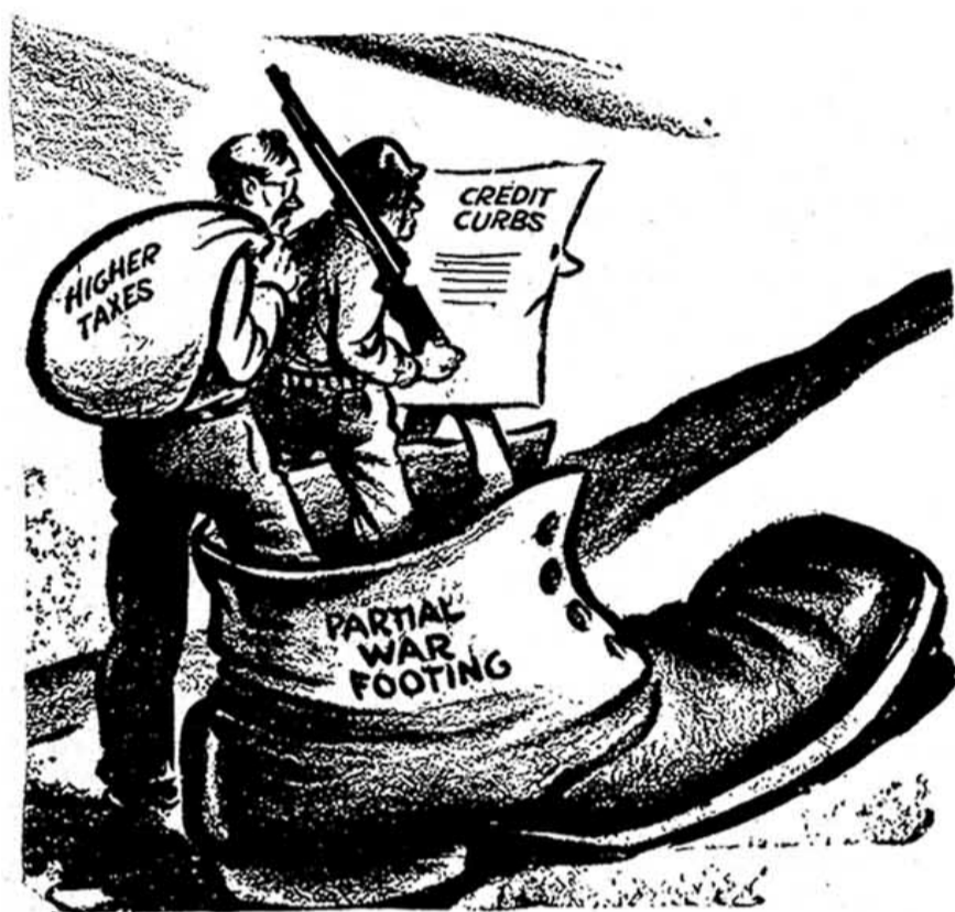
Bishop in St. Louis Post-Dispatch "Forward, March!"

A showdown on economic mobilization shaped up. Congressmen argued over: 1) whether a step-by-step defense effort would be enough; 2) a plea by Bernard Baruch for all-out price, wage, rent and rationing controls.