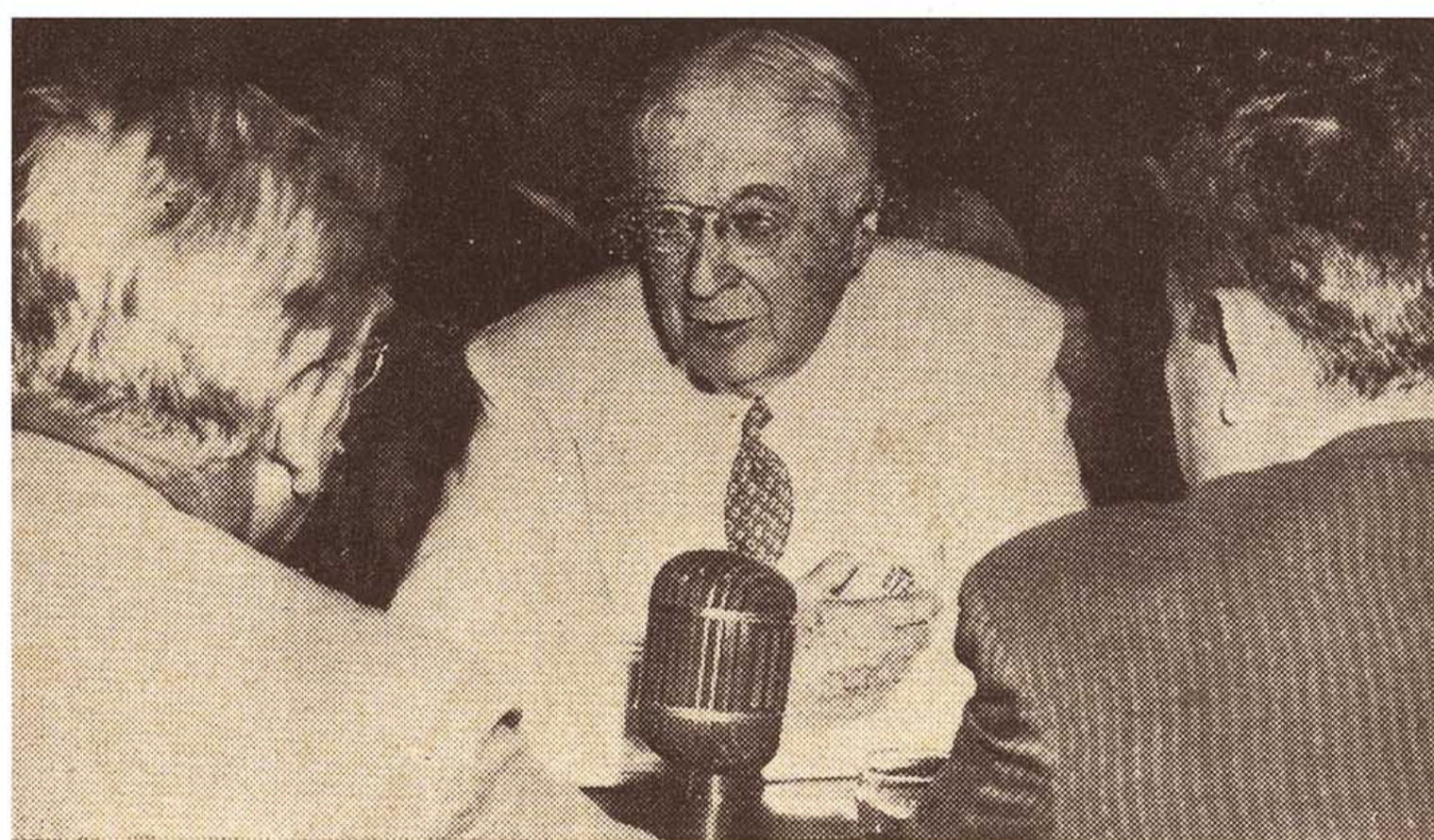
Baruch to Congress: "This isn't a game of mumblety-peg."

Background: The Administration's view was that a $5 billion tax increase, allocation of materials to defense, and certain controls over credit and hoarding would meet first needs. Price controls and rationing might be used later. Critics of Baruch called him an "ex-adviser to ex-