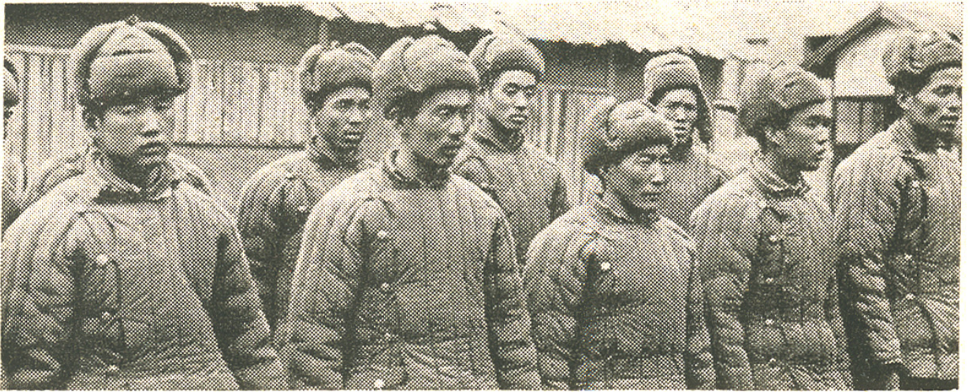
Caught in Korea: Chinese Communist prisoners in U.N. stockade.

Threats of a general war in the Far East grew as perhaps 250,000 Chinese Communists jumped into the battle for Northwest Korea;