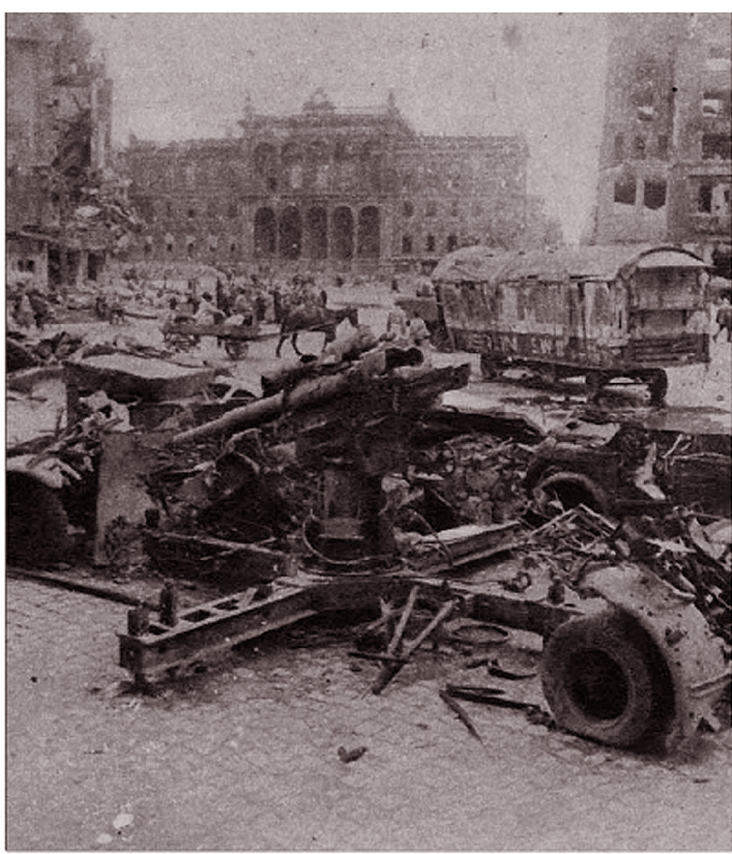
A destroyed German AA gun is left untouched in the heart of Potsdamer Platz, once one of the show places of the city.

"They must be told the entire story of the suffering and death they have made throughout the world. They must have their noses rubbed in the stink of Dachau and in the stink of the German nation under the Nazis. And perhaps it would be well to preserve some of the ruin of Berlin so that they will never forget it."