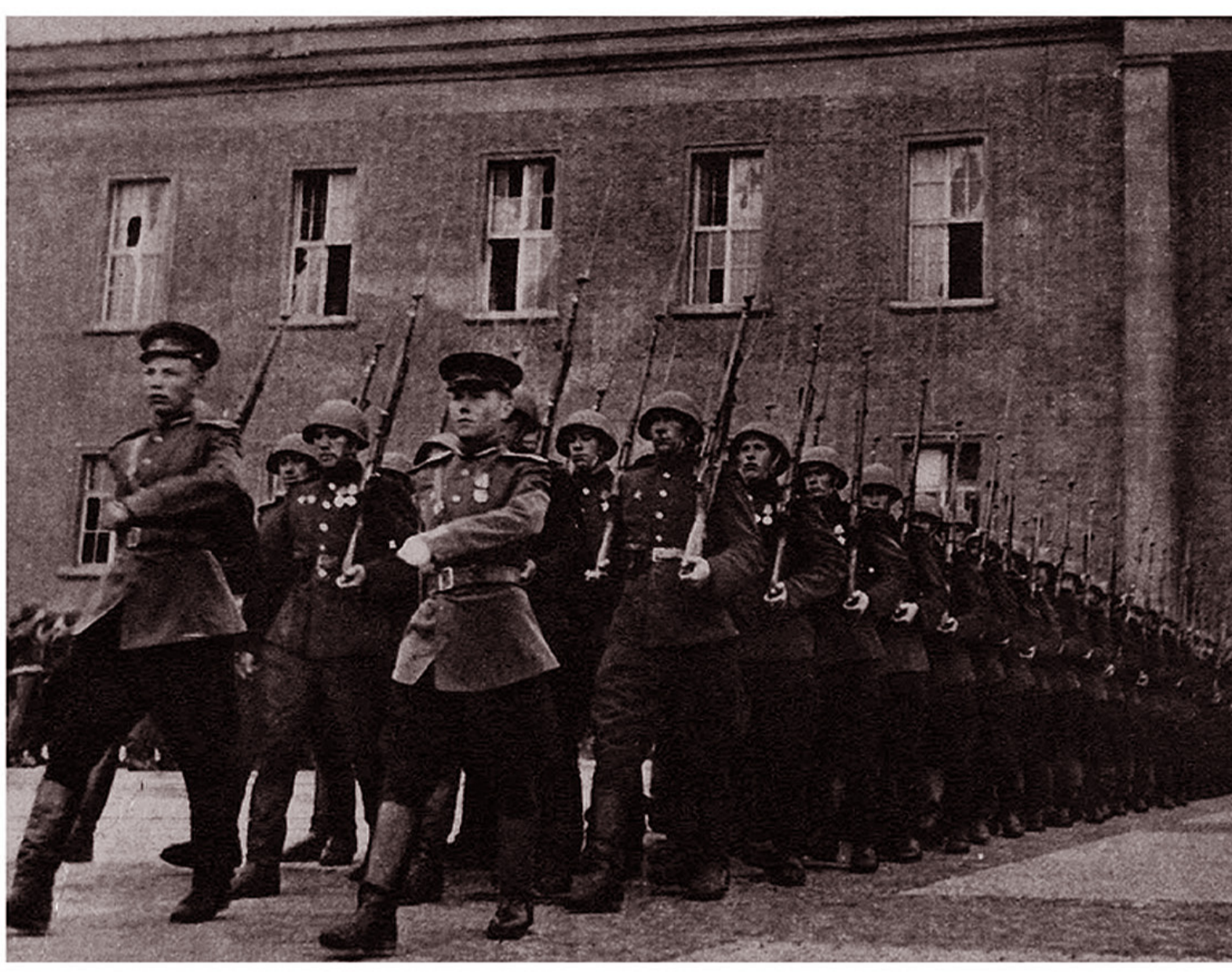
The veteran troops of the Red Army's occupational Berlin Guard parade in front of the Adolf Hitler SS barracks.