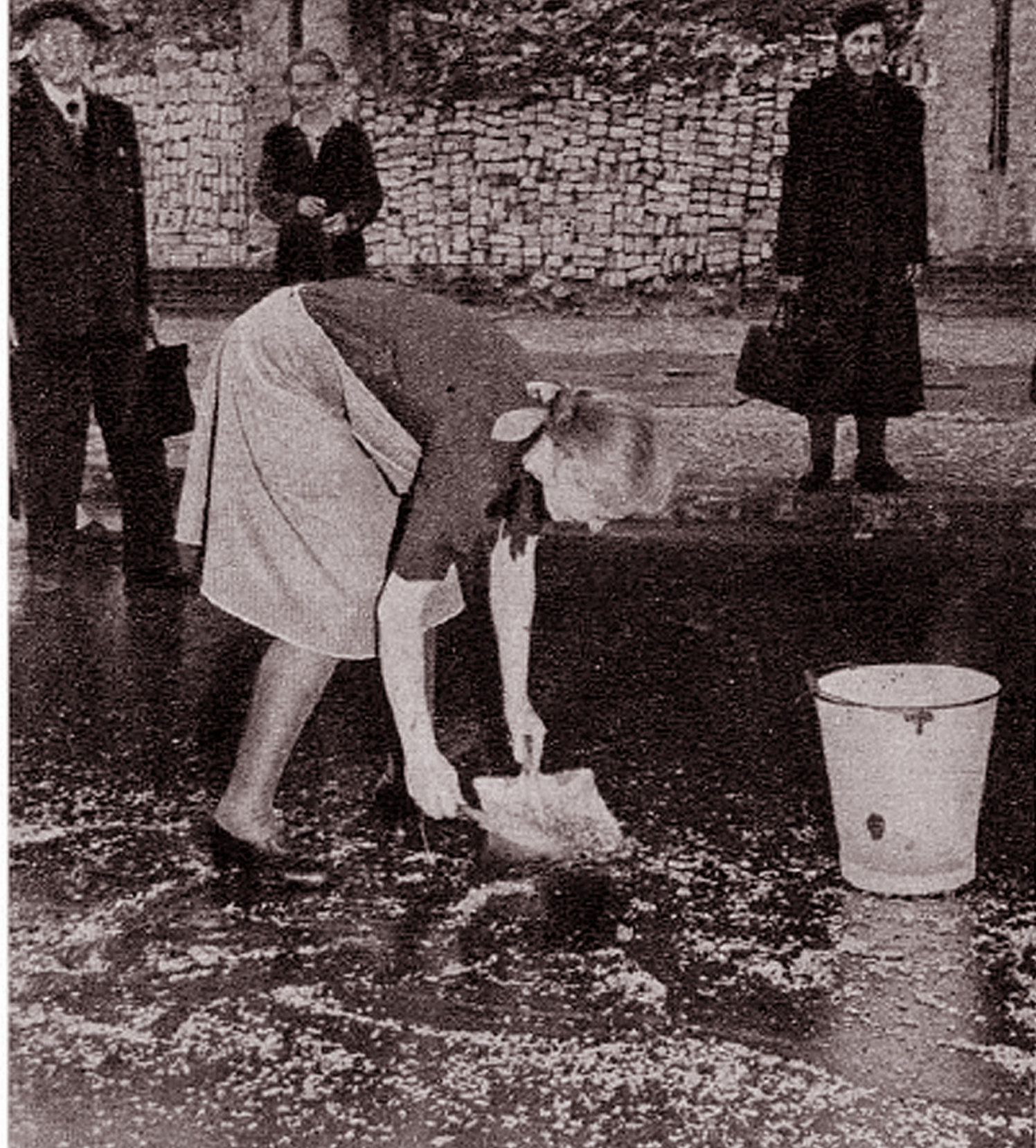
A hungry hausfrau picks up oats dropped from a passing Russian vehicle. She will grind them into a rough flour.