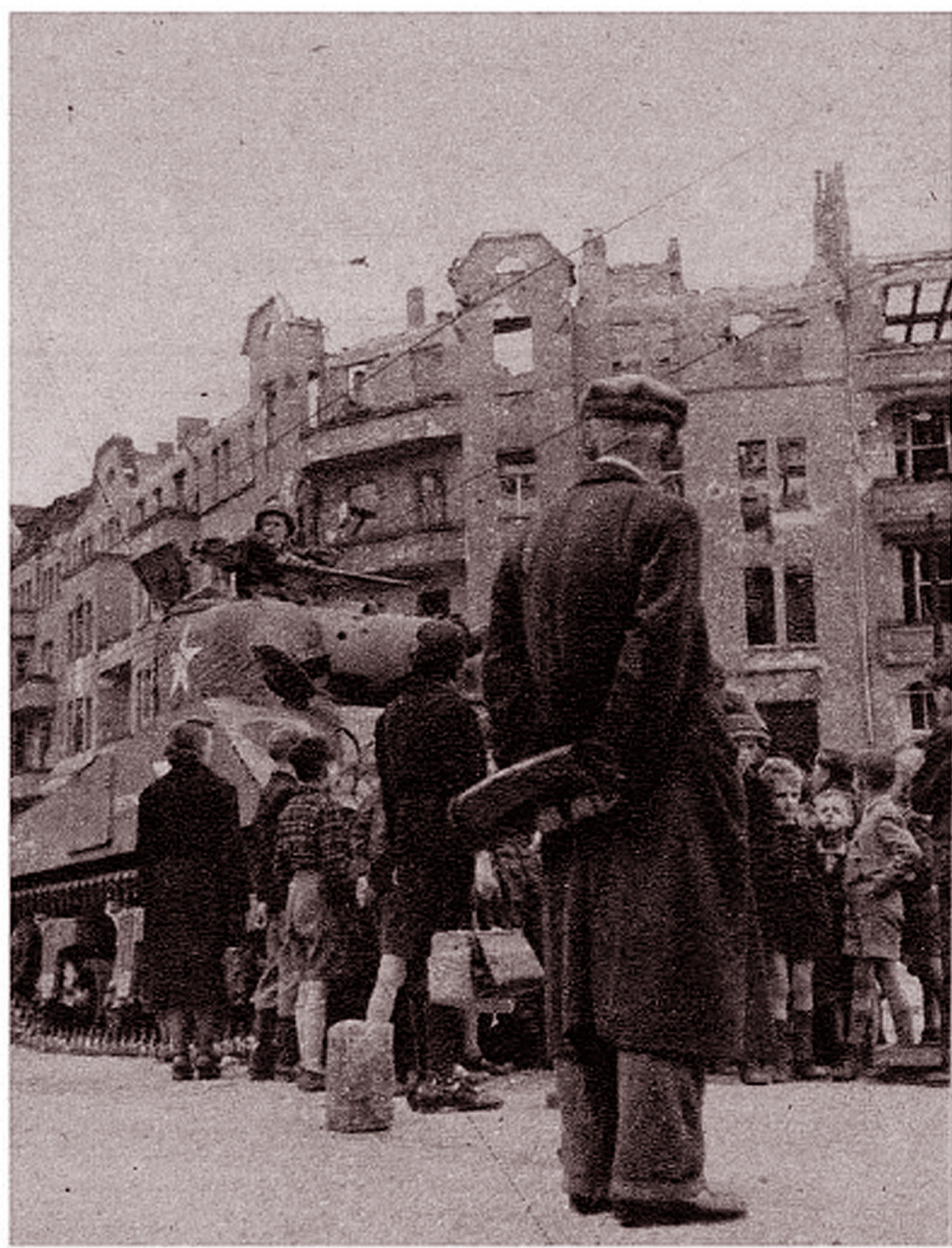
A tank of the Second Armored Division is inspected by the curious citizens of Berlin as a symbol of their defeat.

The Russian soldiers still seem to have a supply of vodka while American GIs are quite dry. A single glass of vodka drunk Russian-style and the whole world has a magnificent old rose hue and language difficulties present no barriers at all to friendship.