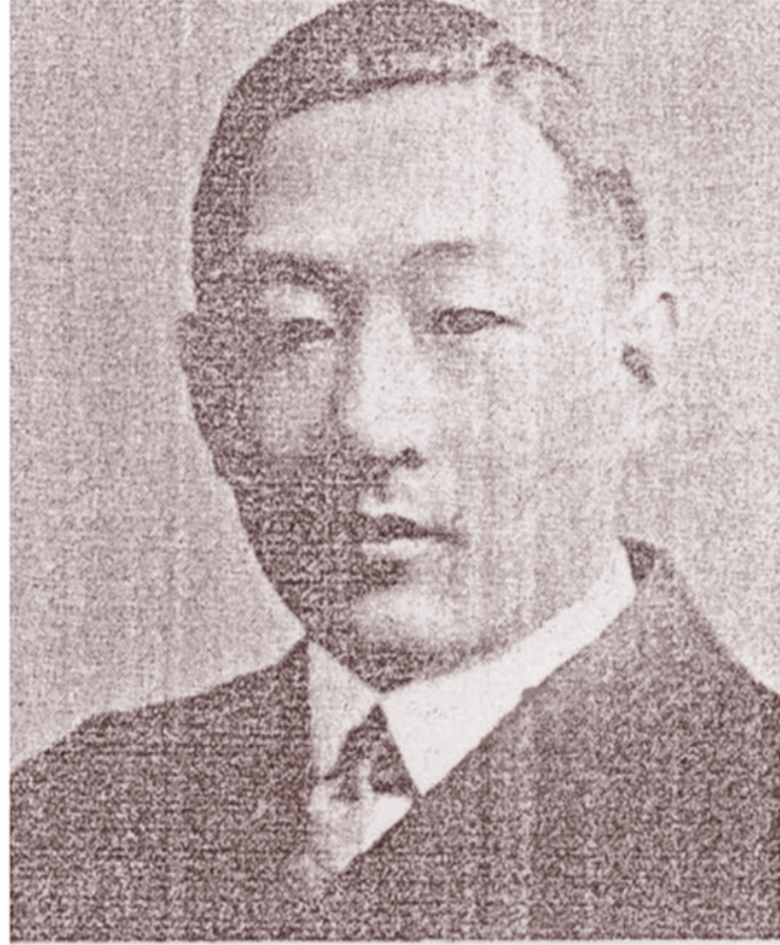
Four family corporations control Japan's Industries. Herewith the Rockefellers, Mellons, Fords and Du Ponts of Nippon: Baron Kichizaemon Sumitomo (above left) embodies Nipponese metal interests, while Baron Takakimi Mitsui (above right) is president of the Mitsui Co., specialists in finance.