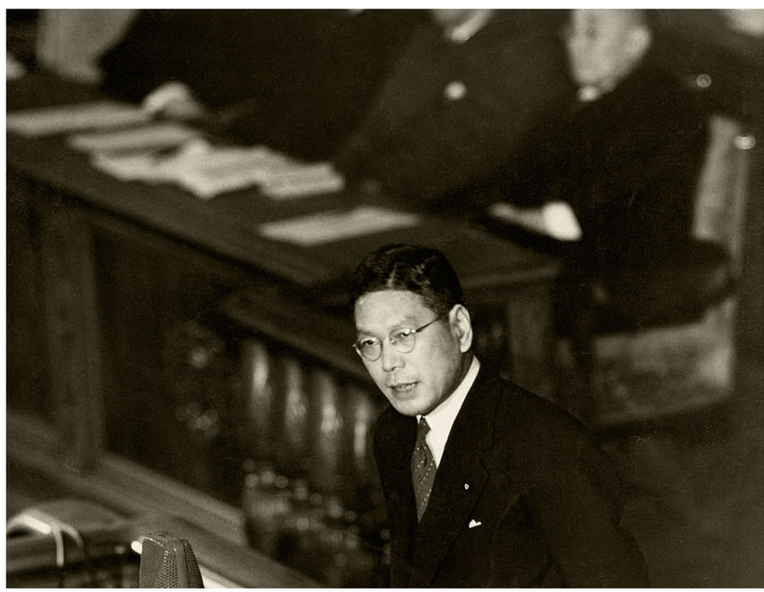
Finance Minister Ikeda Digs Down In Japanese Pockets

A FTER observing for some time the seemingly nonchalant attitude of the Japanese population toward the war measures imposed within the last year, one may find two possible explanations: the proverbial self-discipline of the Japanese race, or—plain indifference. Several signs give convincing proof that the latter is the answer. Old-timers who were in Japan during the Russo-Japanese War voice their astonishment at the lack of excitement on the part of the populace, and government and army officers have begun to express their consternation. Yet, it is the government's own propaganda which is coming right back, a most embarrassing boomerang.