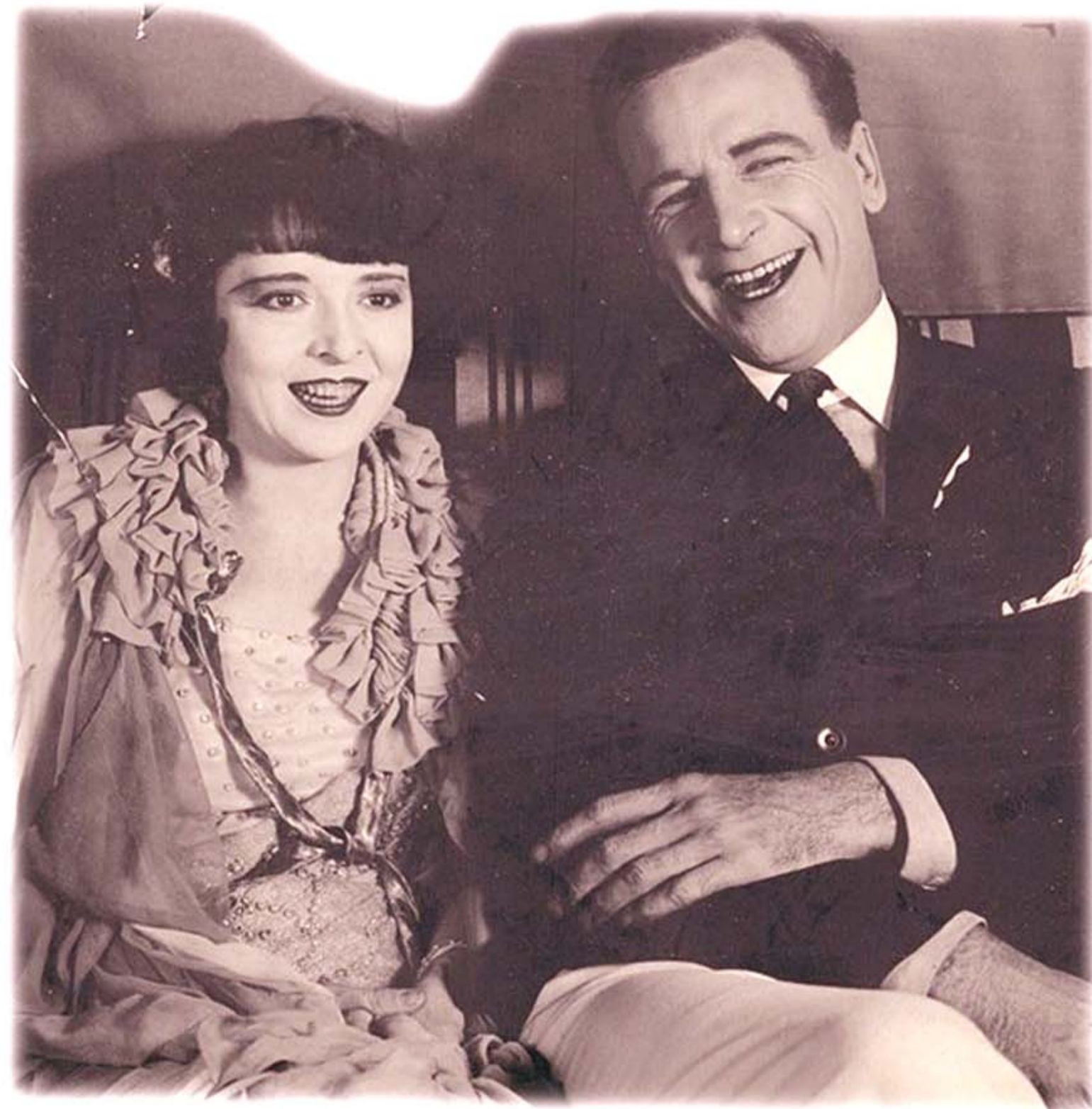
Colleen Moore and Milton Sills as seen in Flaming Youth (1923)

Flaming Youth endeavors to establish that young men and maidens wild are going up in the smoke of their own cigarettes. It contains all the rabble of trashy devices which cinema directors employ traditionally to indicate the younger degeneration, even to the midnight bathing party. All this is unfortunate, since the story of the socially rabid mother who on her deathbed persuaded her physician to write her spirit letters of her daughter's progress, is rather ingenious. She gave the girl the combination of the safe where the letters were to be left, hoping that the reports and reflections therein would fortify her philosophy against a jazz-mad world. Milton Sills and Colleen Moore make much of the leading rôles.