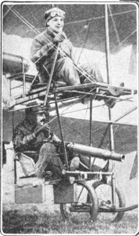
Double-Deck Armed Flying Machine of English Forces

operation radius of about 300 miles, and when carry- ing its crew, 300 rounds of ammunition, and with its oil and fuel tanks filled, it weighs 1,760 lb. It uses a