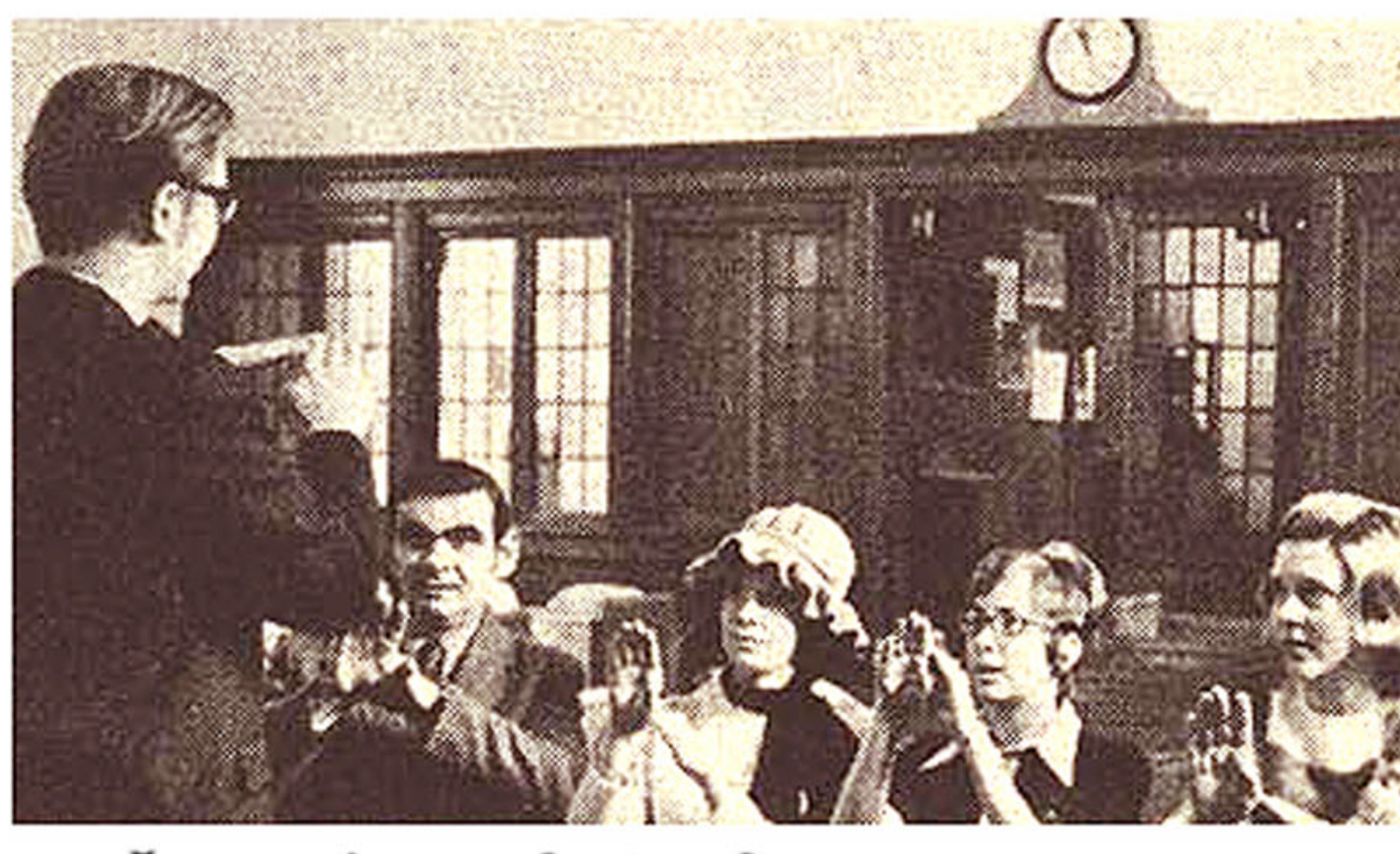
Learning their language, these worshipers "speak" of heaven.

Not a sound can be heard by most of the congregation, but that doesn't stop them from worshiping in a full church service, hymns included. It happens each Sunday at the St. Matthew Lutheran Church for the Deaf, in Queens, New York, where the regular mass is conducted in sign language.