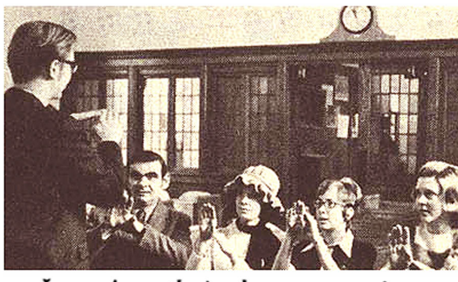
Learning their language, these worshipers "speak" of heaven.

Not a sound can be heard by most of the congregation, but that doesn't stop them from worshiping in a full church service, hymns included. It happens each Sunday at the St. Matthew Lutheran Church for the Deaf, in Queens, New York, where the regular mass is conducted in sign language.