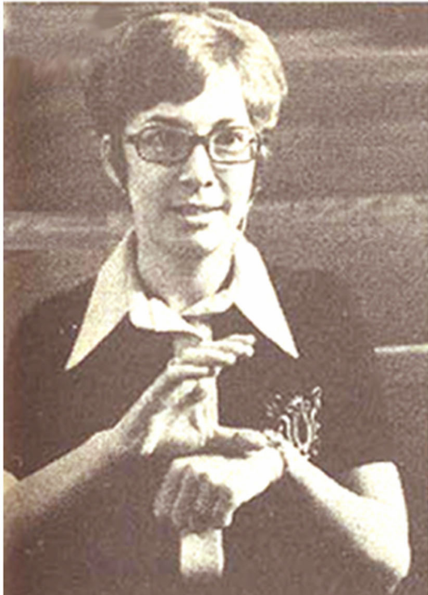
Right hand opened over left is sign language for "church."