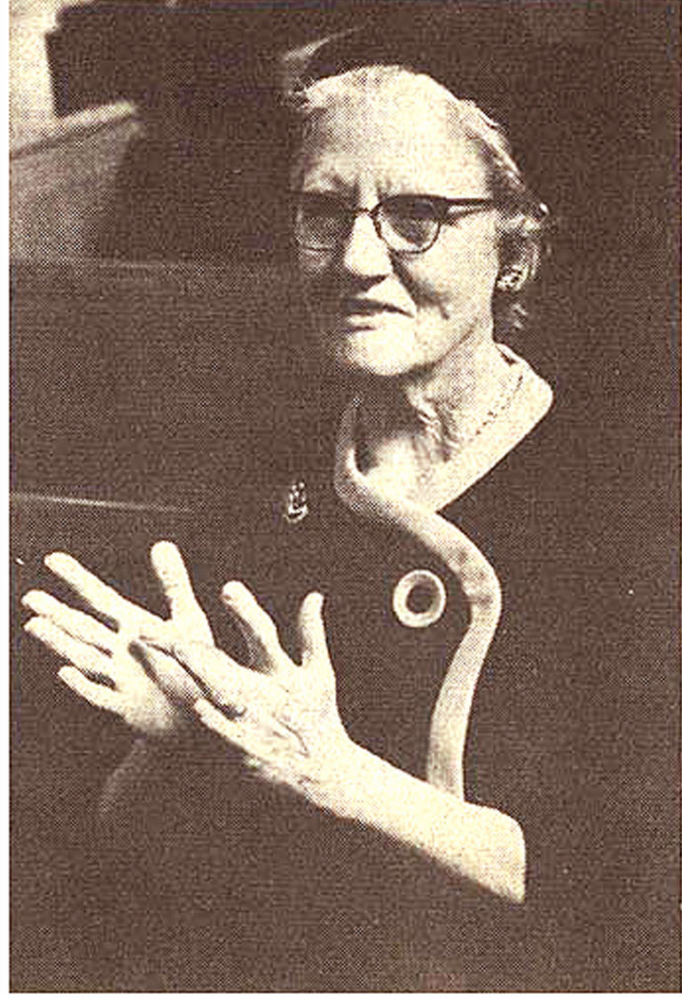
Pointing to the palm, signifying crucifixion, is sign for the name of "Jesus."

Not a sound can be heard by most of the congregation, but that doesn't stop them from worshiping in a full church service, hymns included. It happens each Sunday at the St. Matthew Lutheran Church for the Deaf, in Queens, New York, where the regular mass is conducted in sign language.