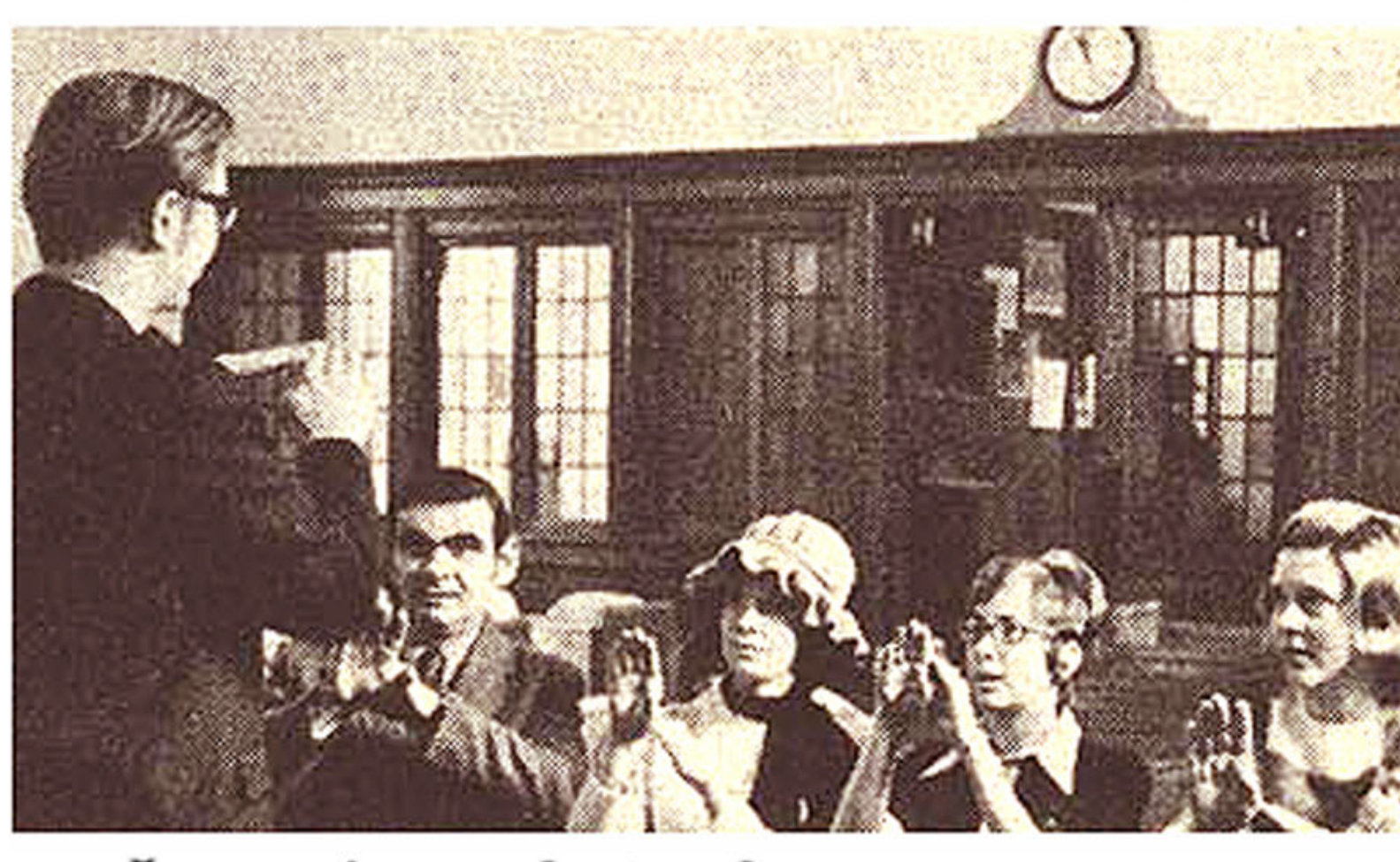
Learning their language, these worshipers "speak" of heaven.

Not a sound can be heard by most of the congregation, but that doesn't stop them from worshiping in a full church service, hymns included. It happens each Sunday at the St. Matthew Lutheran Church for the Deaf, in Queens, New York, where the regular mass is conducted in sign language.