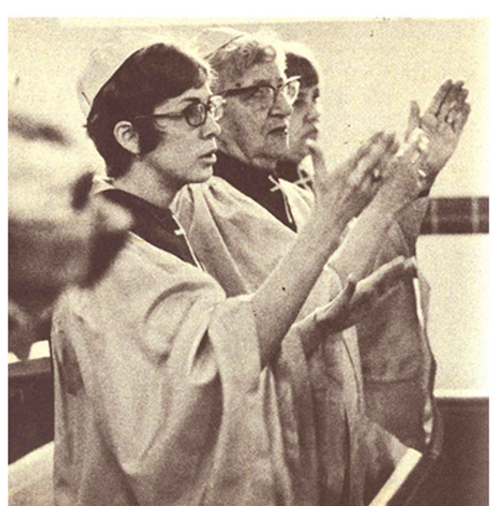
Choir's "My Redeemer Liveth" proves religious expression need not be vocal.