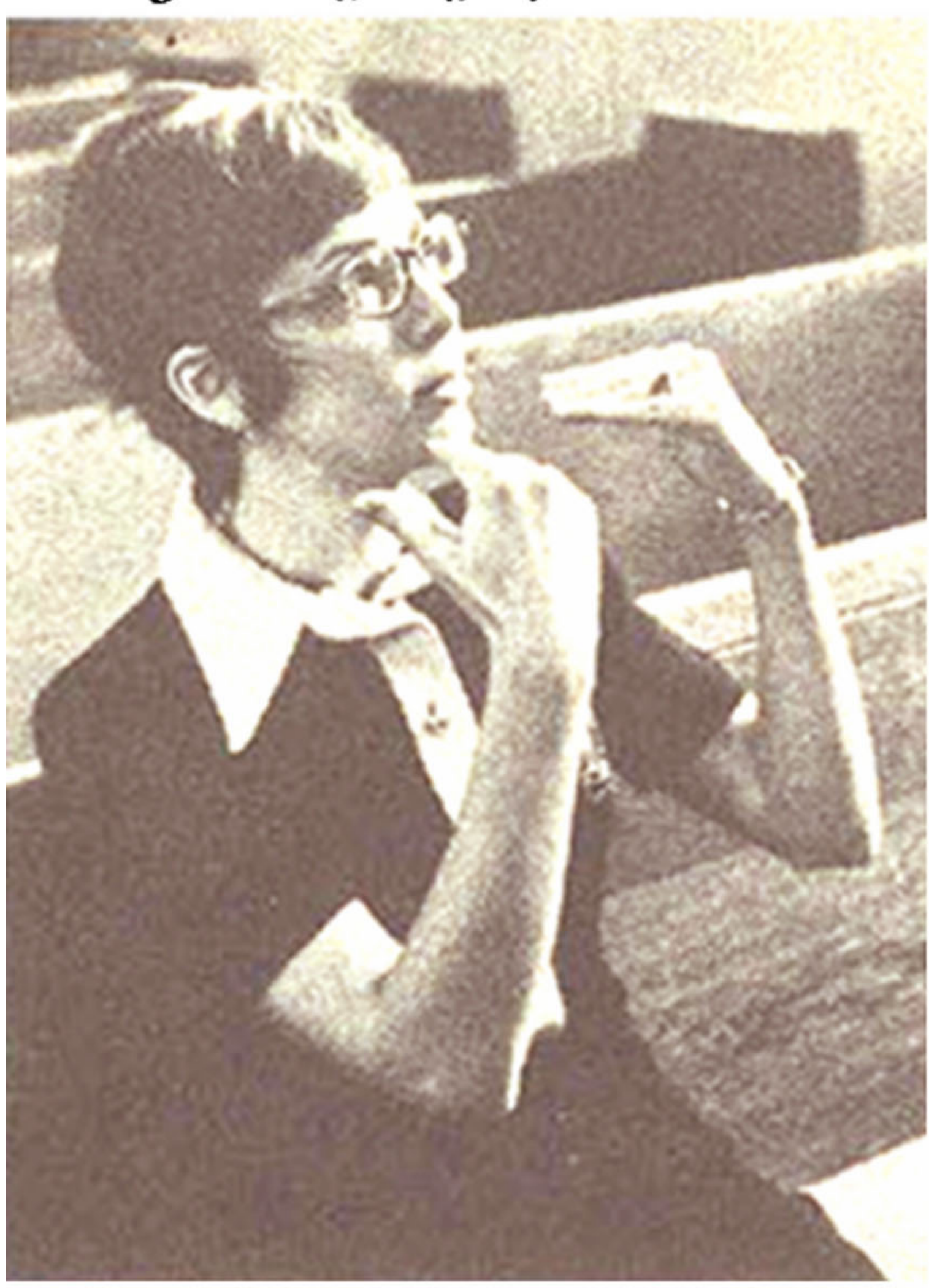
Hands drawing inward illustrates "thank-you" to God.