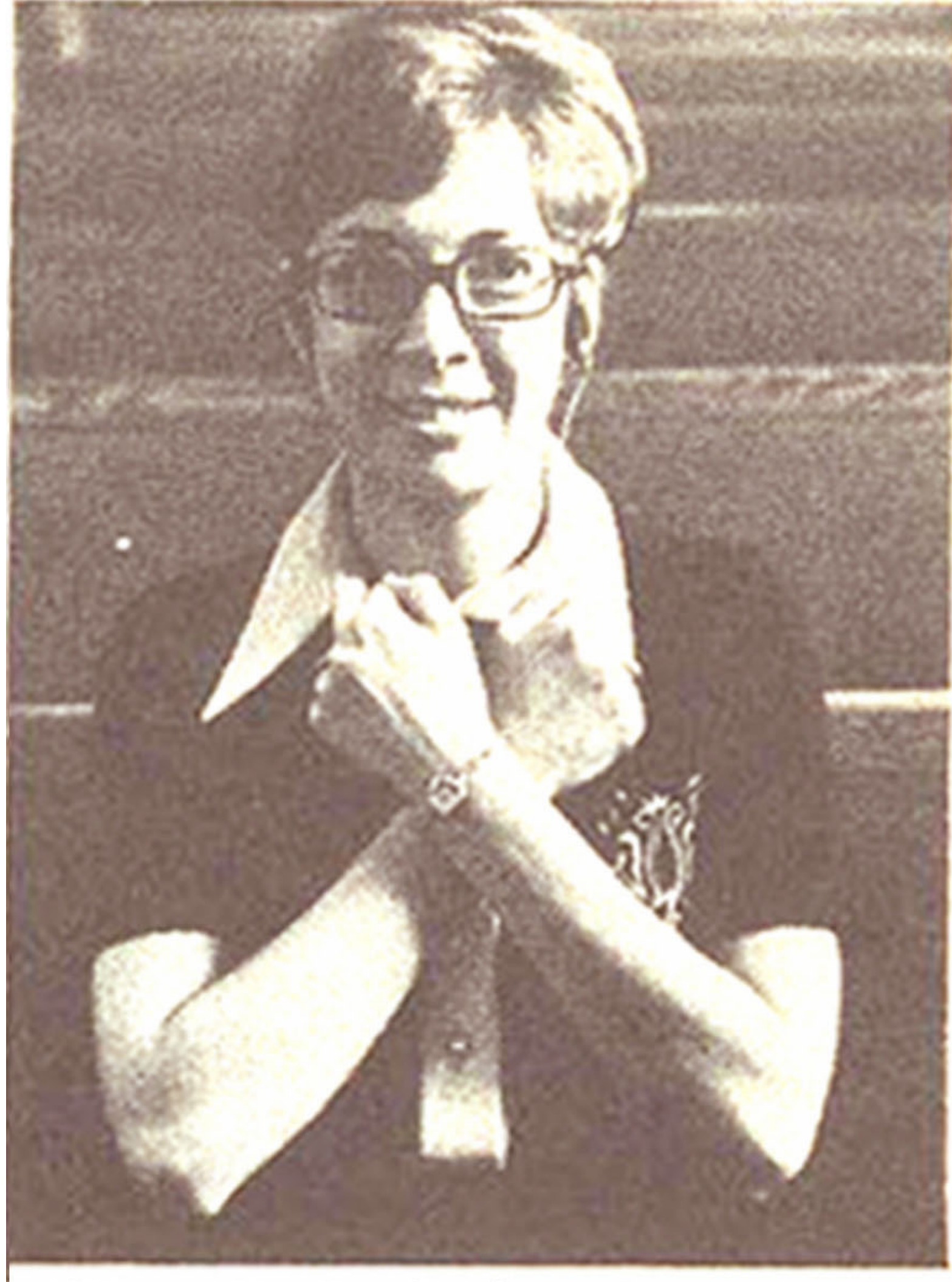
"Love"-sign's hands are two people bound over the heart. Visual aids help teach deaf children in Sunday-school program.