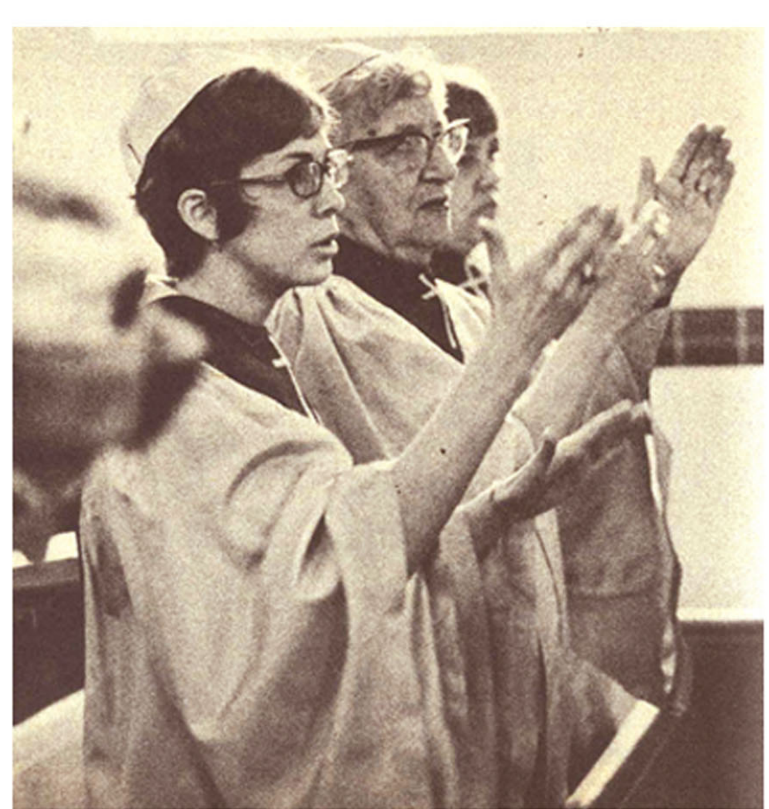
Choir's "My Redeemer Liveth" proves religious expression need not be vocal.