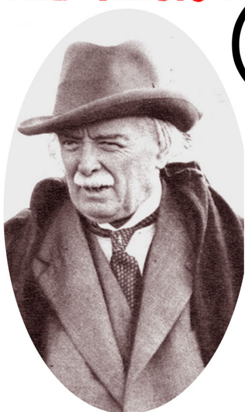
Former British Prime Minister Lloyd George