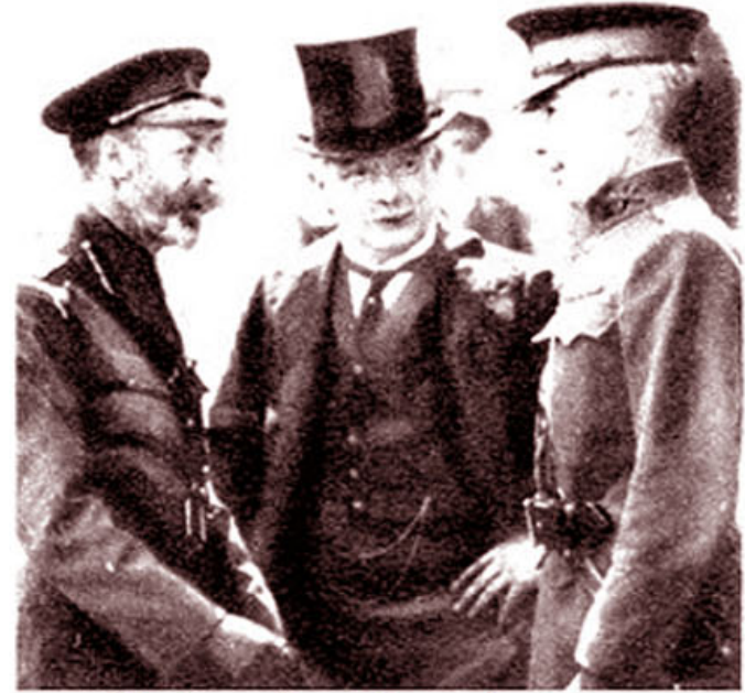
Victory Premier of 1918, Lloyd George knows his facts

It is just over twenty-one years ago that France and Britain signed the armistice with Germany which brought to an end the bloodiest war in history. They are now fighting essentially the