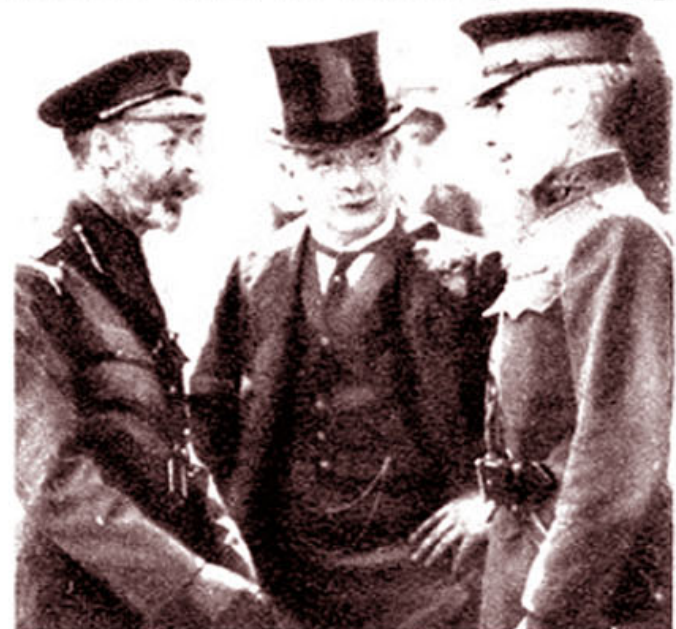
Victory Premier of 1918, Lloyd George knows his facts

It is just over twenty-one years ago that France and Britain signed the armistice with Germany which brought to an end the bloodiest war in history. They are now fighting essentially the