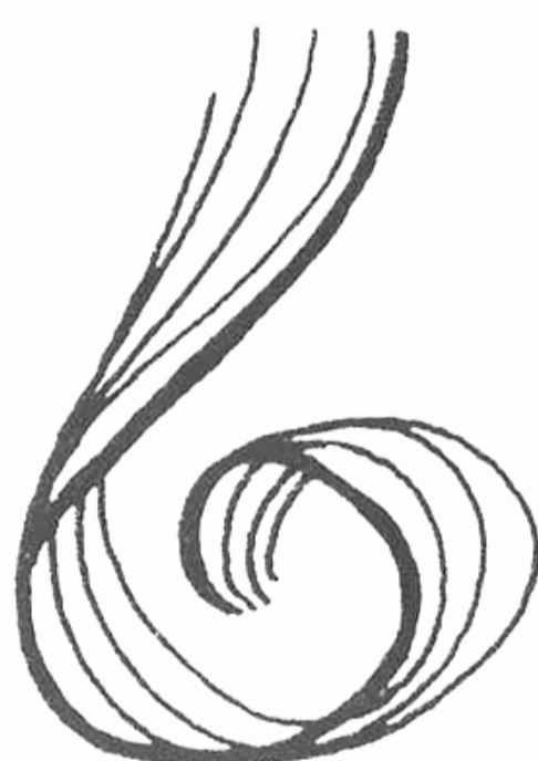
Curl No. 3: just wind the end so curl looks like figure 6