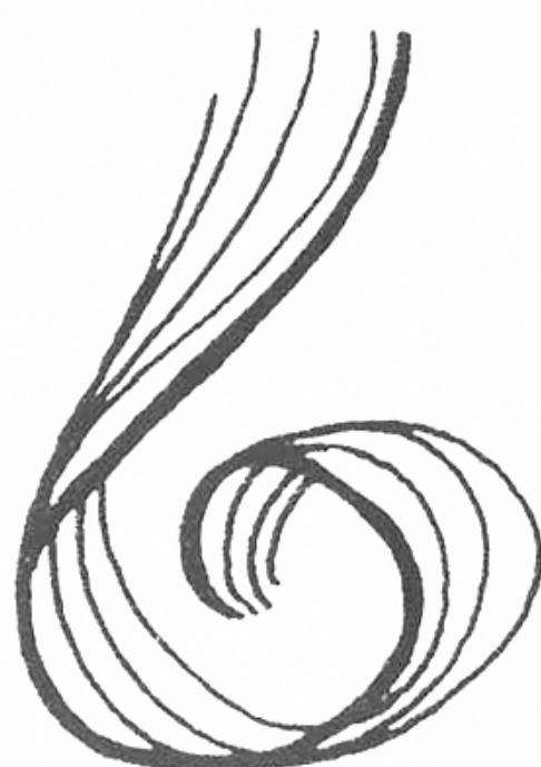
Curl No. 3: just wind the end so curl looks like figure 6