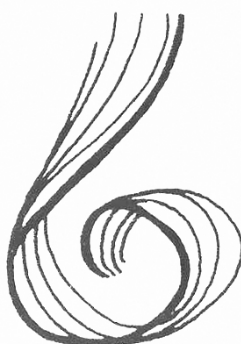
Curl No. 3: just wind the end so curl looks like figure 6