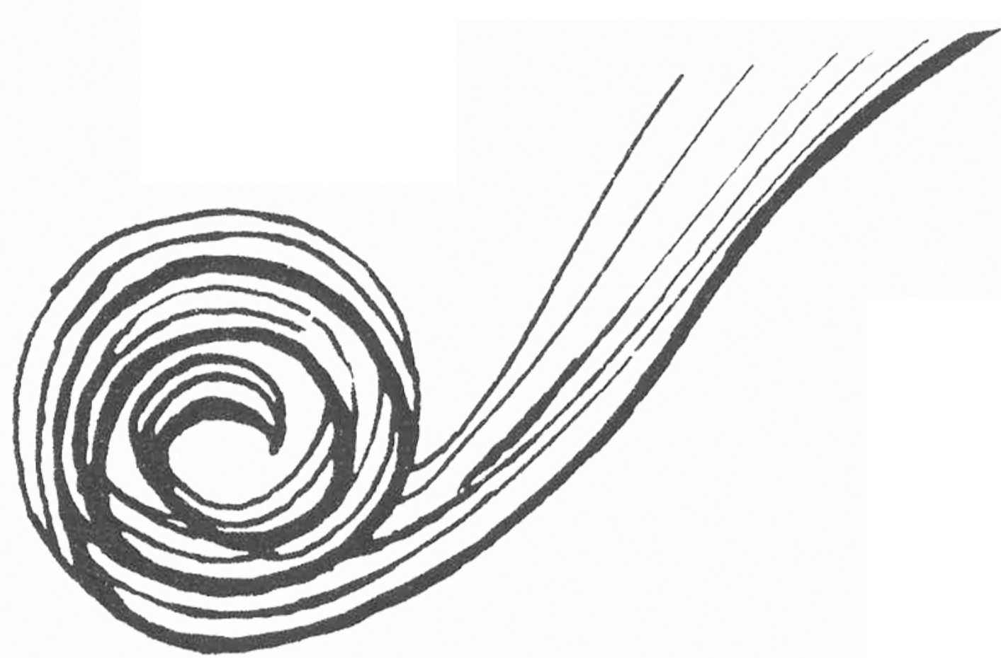
Curl No. 2: outside ring is the largest; inside smallest