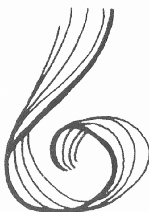
Curl No. 3: just wind the end so curl looks like figure 6