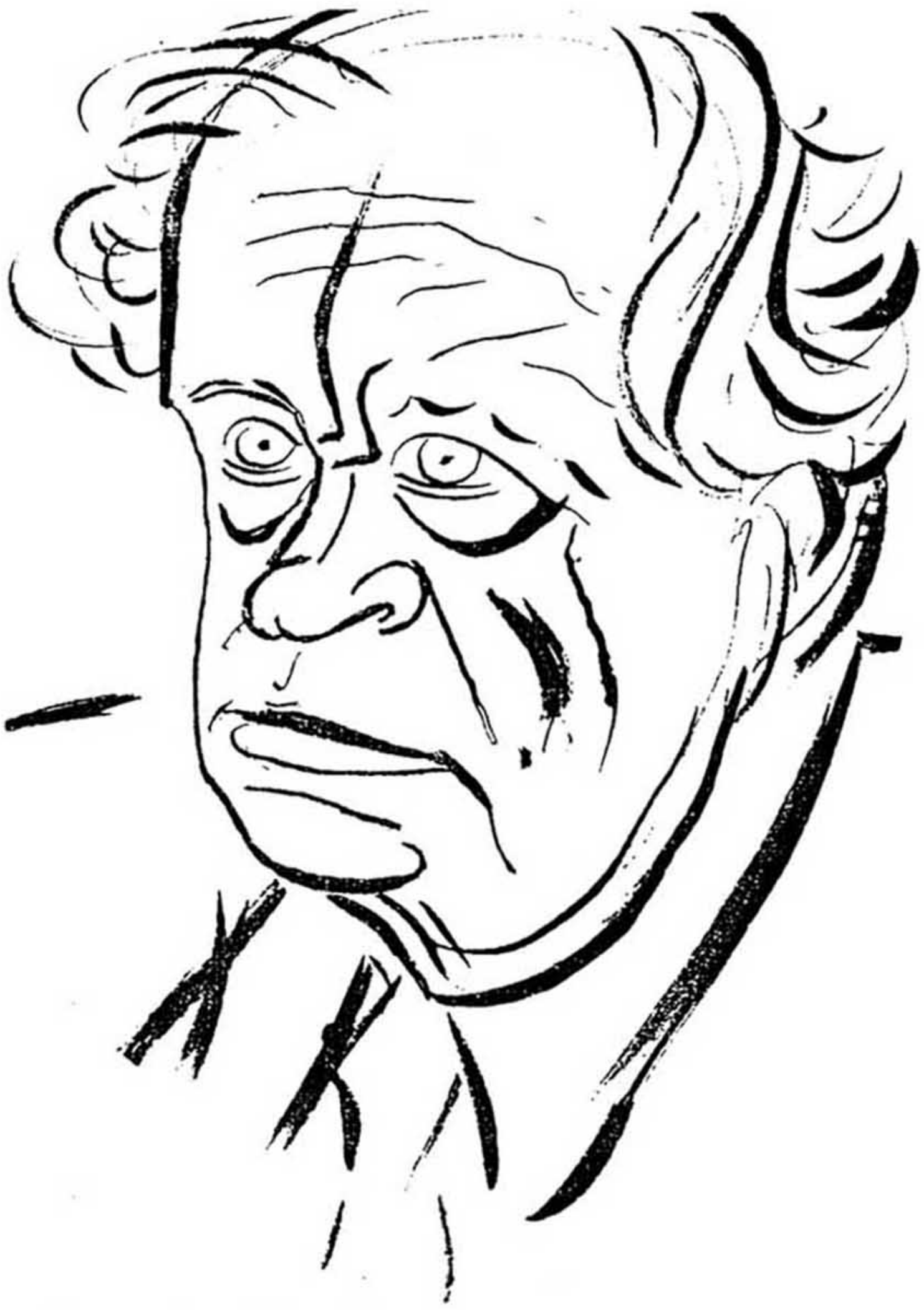
Portrait of Art Young by José Clemente Orozco

I F A man's countenance can ever sum up the story of his life, such certainly is the case with the countenance of Art Young, the beloved old American artist whose radical cartoons have made him famous far and wide across nearly three-quarters of a century.