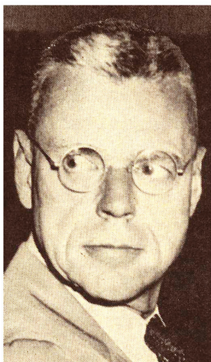
DR. C. P. RHOADS