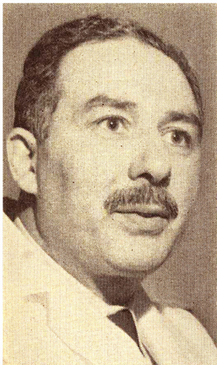
DR. SIDNEY FARBER