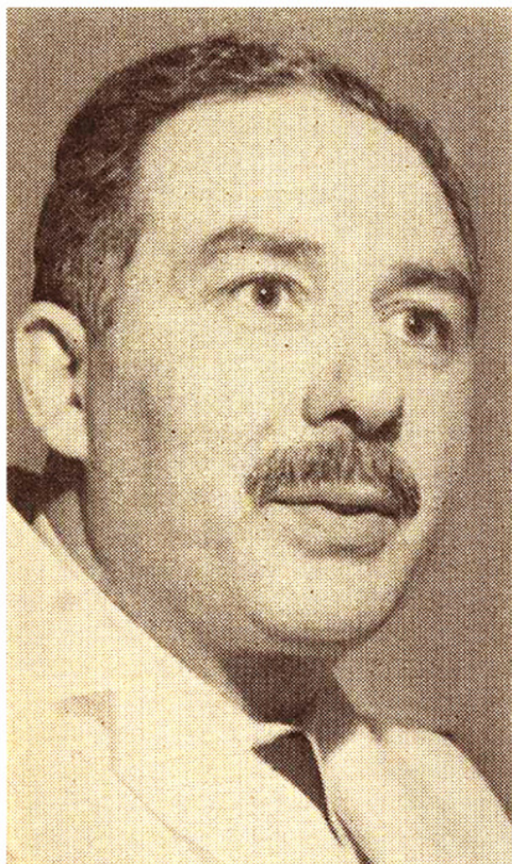
DR. SIDNEY FARBER