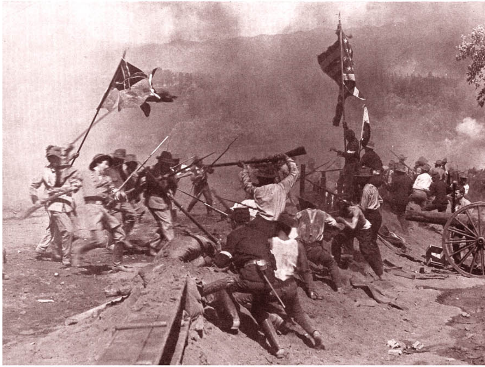
Battle scenes were photographed near Universal Ranch not far from Los Angeles

nies hadn't been paid, even the rental on the charger hadn't been paid. Griffith, with God knows what extravagant promises, had been able to engage a reasonably unmusical brass band to play Dixie as the procession marched.