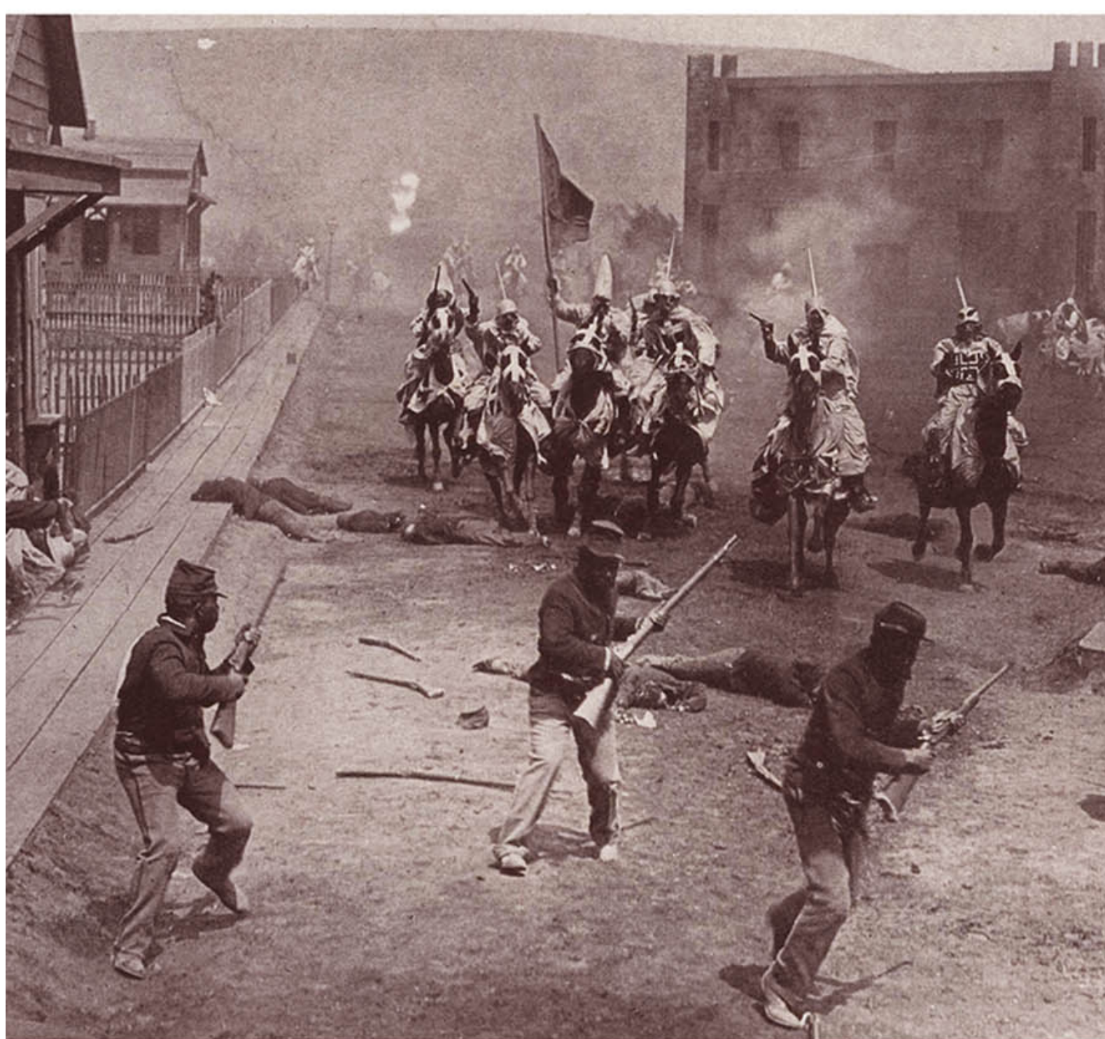
Cowboys swathed in 25,000 yards of white sheeting made up the Ku Klux Klan. An entire county (rent: $10,000 a day) was used in filming their wild rides