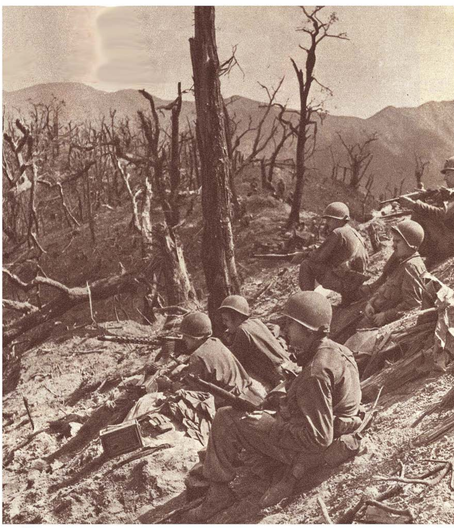
Victorious Americans poised to defend the hills they captured after a month-long struggle

T HE tired, unshaven major looked up at the chaplain and grinned ruefully. "They're taking a beating, Father," he said. "They're giving a beating, too, but not many men are left."