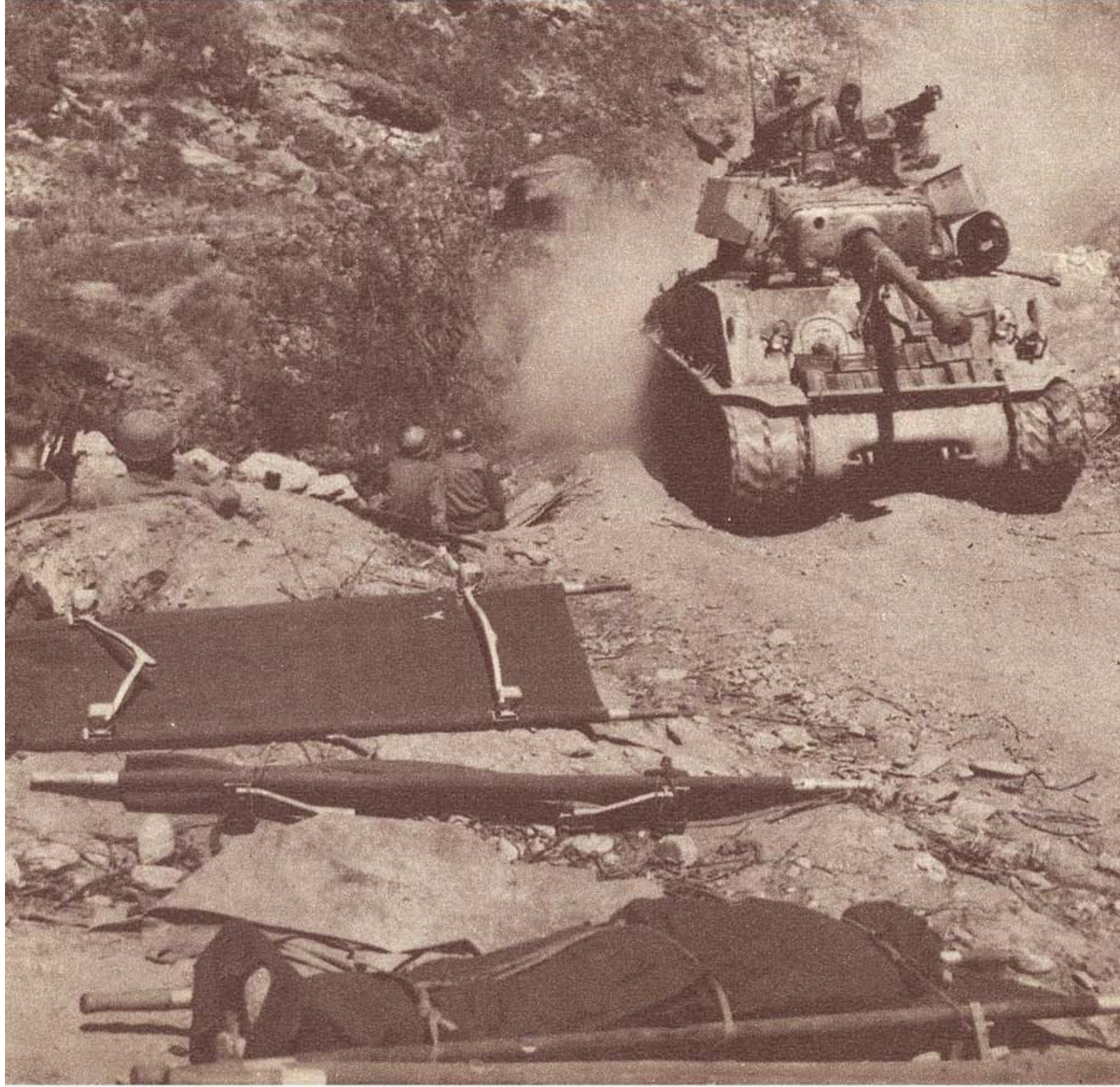
An American tank rumbles down a road on Heartbreak Ridge, passing a machine-gun position and litters for dead and wounded.

southern end of Heartbreak Ridge, and a battalion of the 9th Regiment was able to take the southernmost peak with only four casualties.