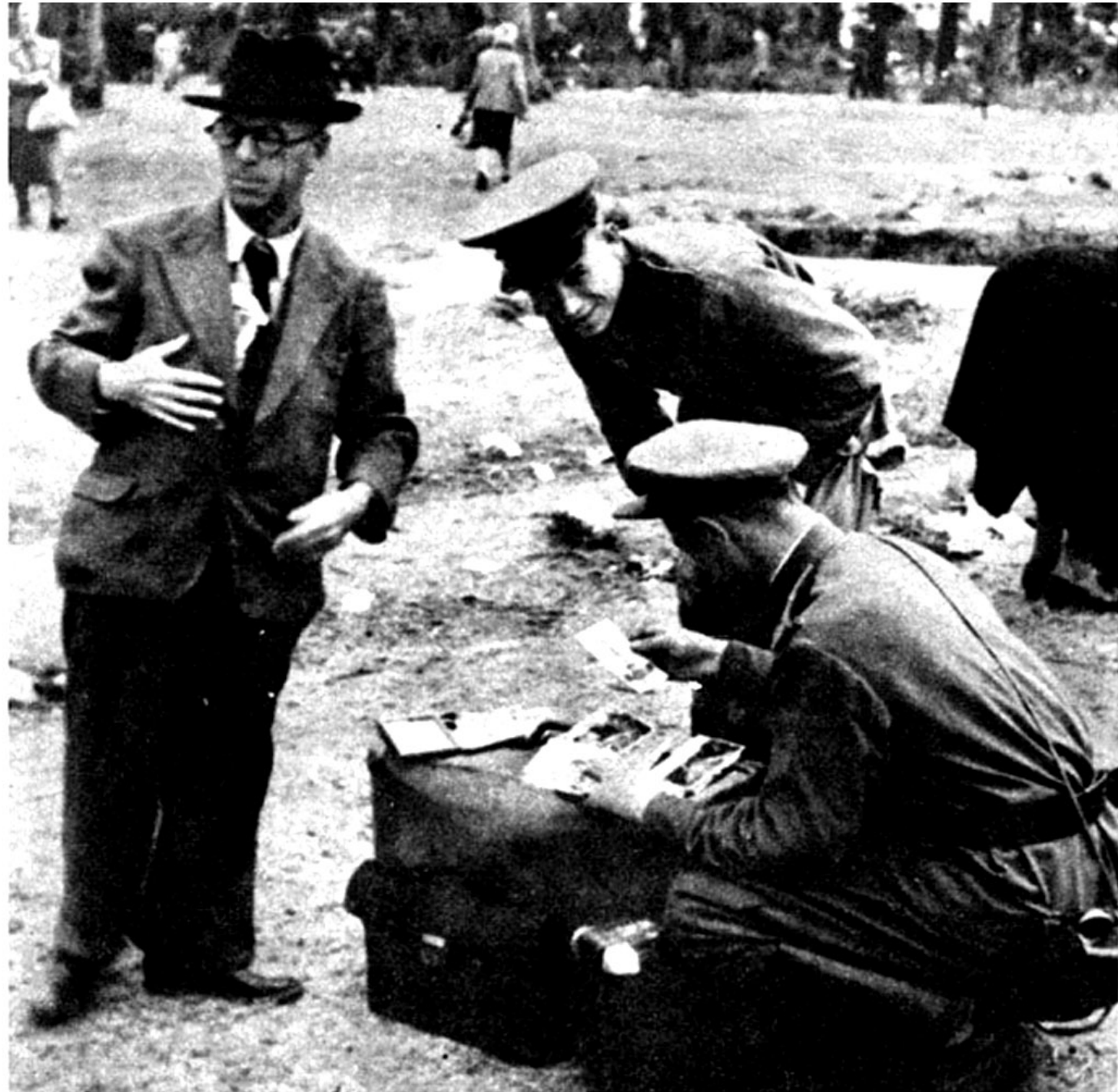
Russian secret policemen, agents of dreaded MVD, examine photographs found on spy suspect, stopped during raid in Tiergarten, center of espionage black market.

These men—and women—are not spies in the conventional sense of the term. They are what is known in Intelligence lingo as "confidential informants."