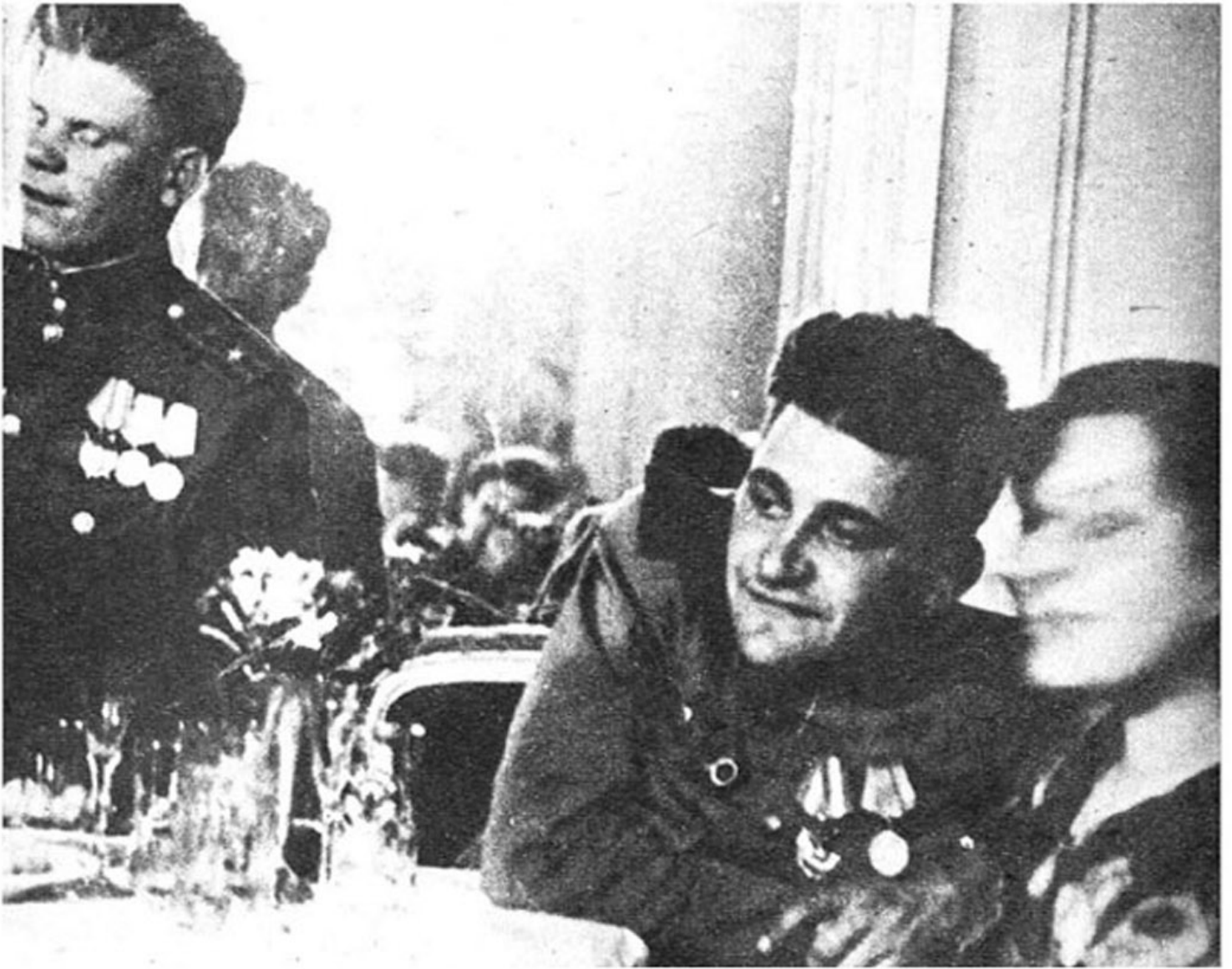
Landid camera in Berlin's swanky Cafe Femina, clearing house of spy secrets, catches Russian officers, blurs girl operative who moved to escape identification.