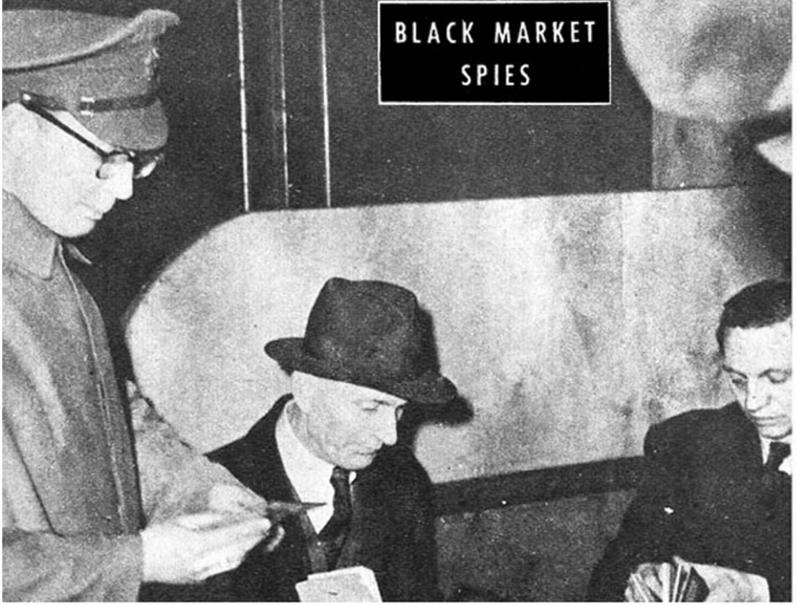
British MP catches operatives peddling papers in Berlin bar frequented by black marketeers of post-war espionage. Man in center paid 3,000 marks for documents.

Among the most successful big-time operators is a student from Chicago who went to Berlin to work his way through college. He now has a miniature castle in Zehlendorf, a chauffeur-driven car with ample supplies of black market gasoline, a butler, two Rembrandts. The one thing he hasn't got is the college degree he went to Berlin for.