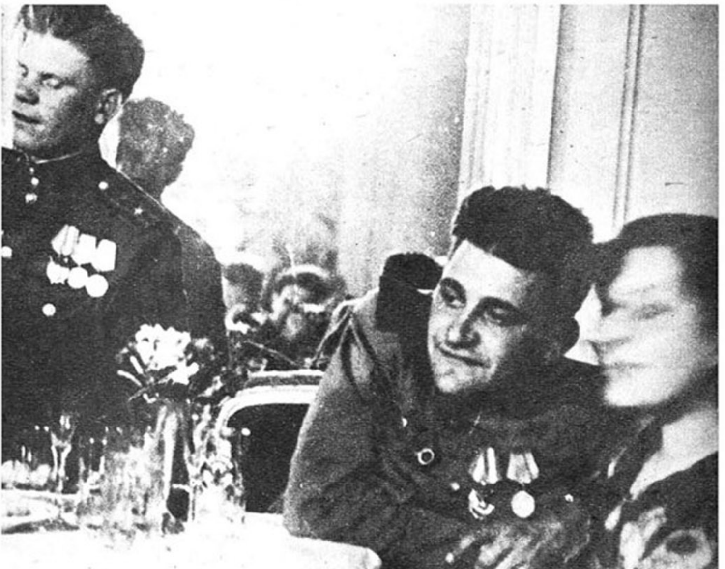
Landid camera in Berlin's swanky Cafe Femina, clearing house of spy secrets, catches Russian officers, blurs girl operative who moved to escape identification.